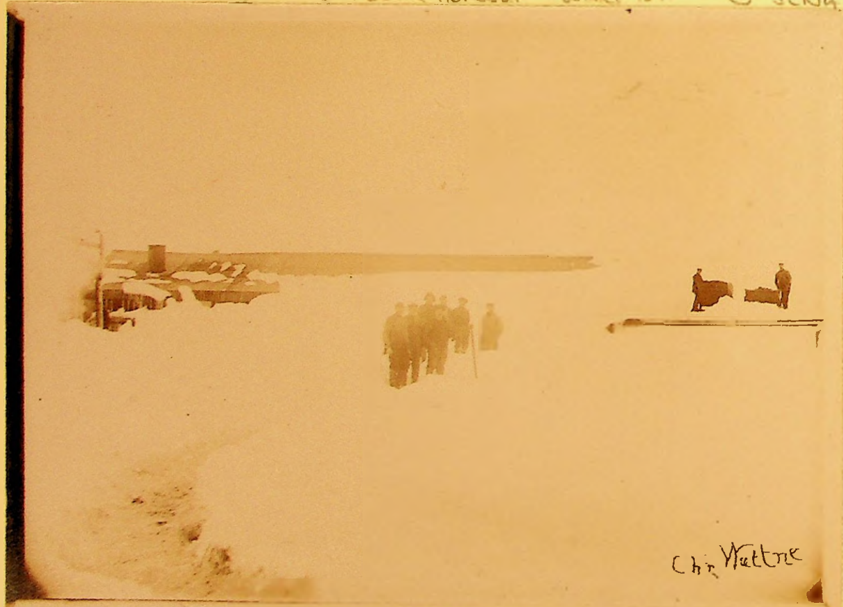
56 - 0054-A1 Whaling station, Leith Harbour - Winter 1915