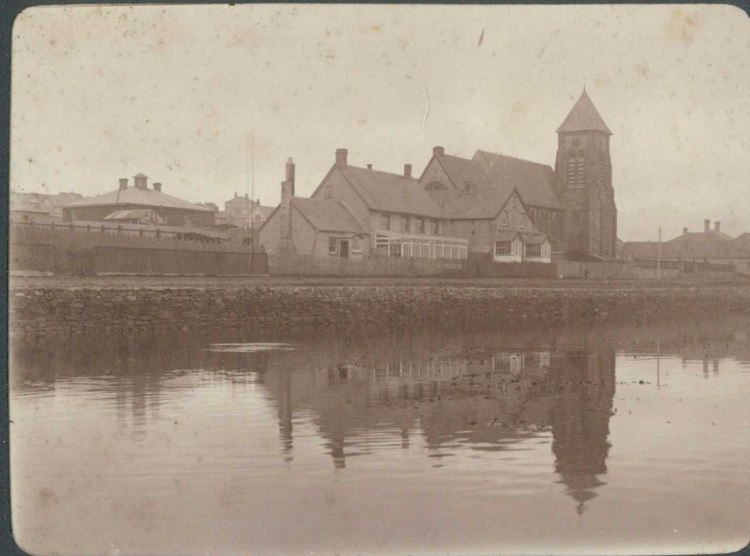
Christ Church Cathedral