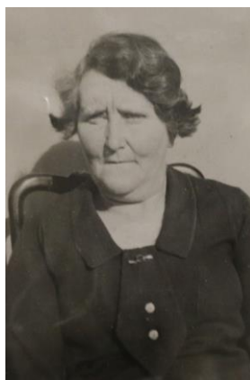
Flora in 1937