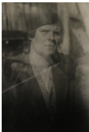
Violet in 1930