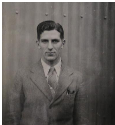
Russell in 1939