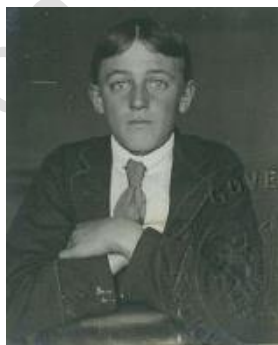
Humphrey in 1919