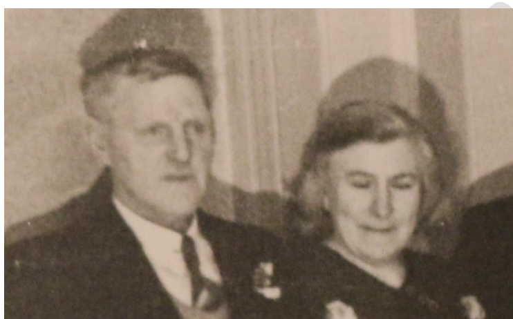
Con and Lucy in 1951