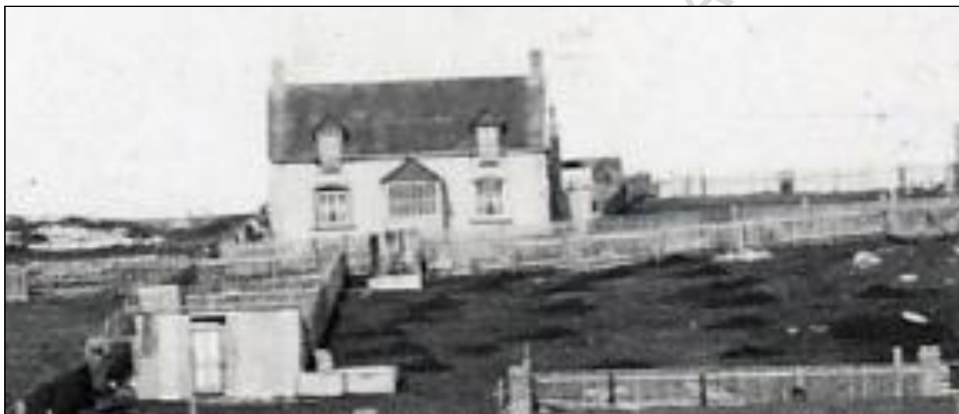
Pill House in 1927