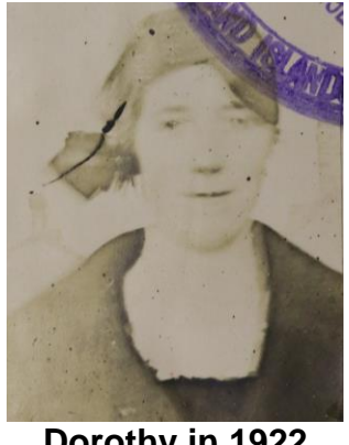
Dorothy in 1922