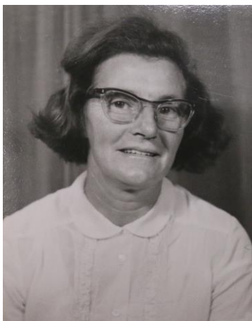
Orissa in 1962