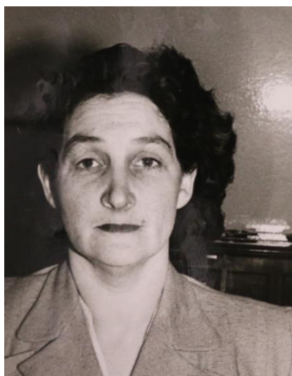
Elizabeth in 1962