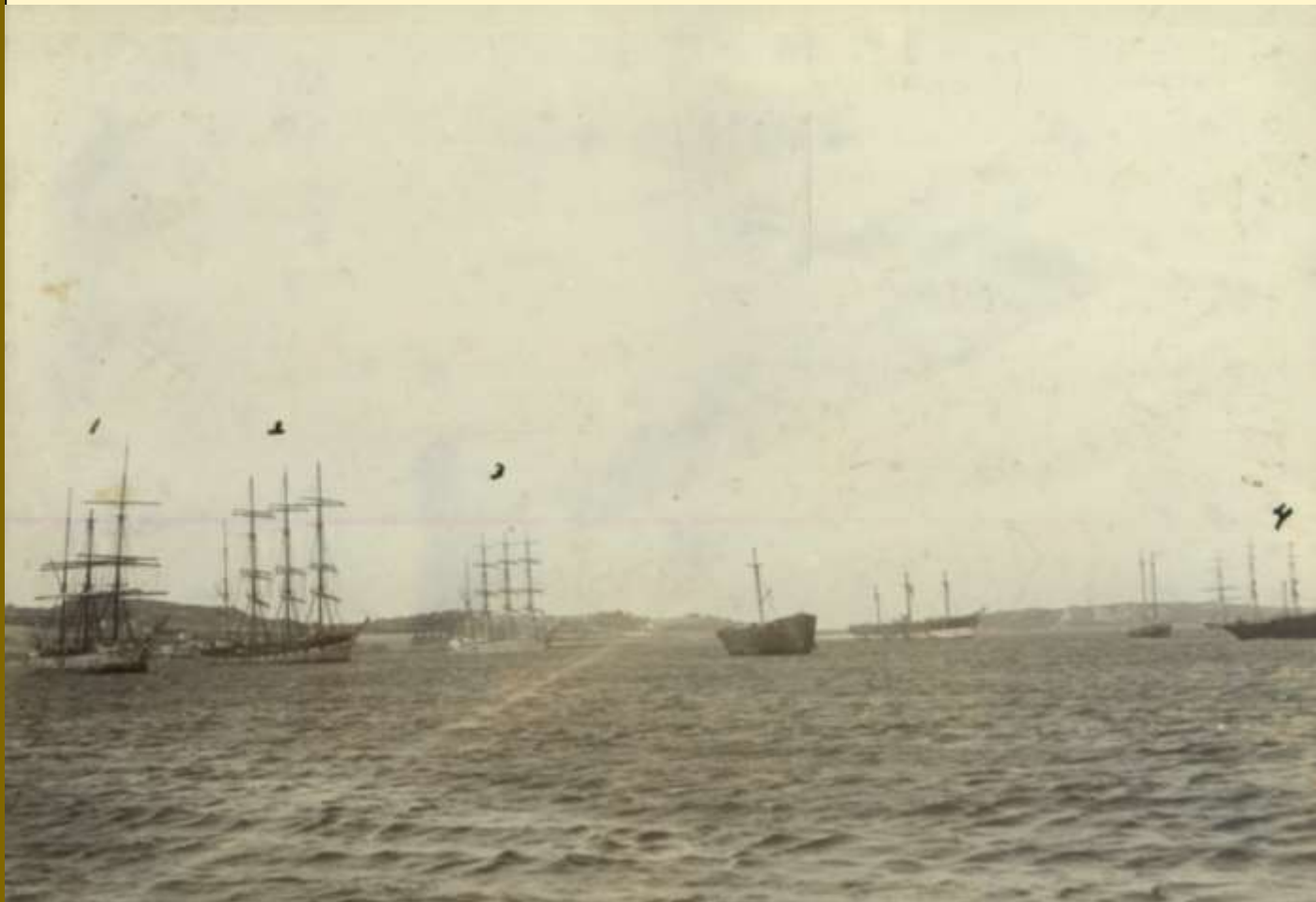
November 1911—Stanley Harbour looking towards The Narrows.

was estimated as being about £1,250. By 27 November 1911 the Colonial Manager hoped to have the Claverdon away by Christmas. On survey it was found that 61 bags of wheat were damaged by water and they were sold. The London Salvage Association had cabled to prevent discharge of cargo and to get the ship away as soon as possible. By 23 December 1911 it was hope to get her away by the end of the first week in January but she was not recorded as leaving until 11 January 1912. [SHI-REG-1: FIC/D12; 175; 185; 193]