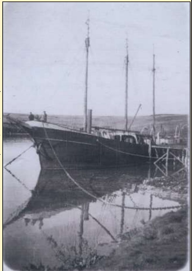
Bellville at Albemarle