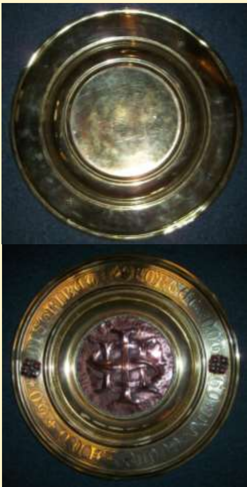
Offering plate in Christ Church Cathedral