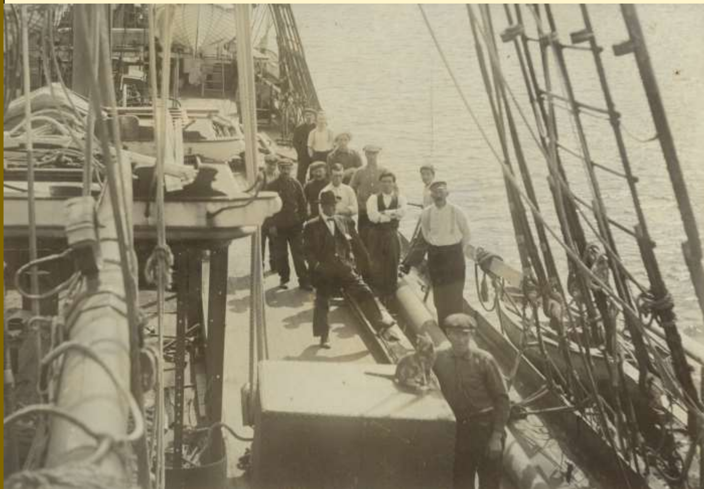
Crew and ship's cat of the Nuuanu , in Stanley Harbour

near Point. Salvage was claimed by Captain SAANUM of the Columbus . Repairs were estimated as taking twelve weeks with repairs costing in the neighbourhood of £2,500 and that the Falkland Islands Company Ltd could hardly commence repairs before the beginning of the new year. By 23 December 1911 work hadn't commenced as the Claverdon wasn't finished and the Nuuanu wasn't expected to get away before March. Repairs commenced in January 1912 and the Falkland Islands Company Ltd were awaiting the arrival of 5/16" plates. The damage was of such a general nature that the repairs entailed work on bulwarks, decks, deckhouses, general ironwork aloft, new top gallant mast, rigging and sails. The master had to draw about £70 in case to pay off his second mate and it was probable with the long detention that he would require a fair quantity of provisions. By mid-February repairs were proceeding satisfactorily. By 15 April 1912 the repairs were practically completed and it was hoped to get her away sometime that week. The Nuuanu sailed 20 April 1912 and returned on the 23rd with the truss of the foreyard broken. She sailed again on the 26th. The master gave drafts for £2,000 and £1,275-14-0. The cost of materials mounted up to much more than anticipated and it was necessary to pay off some of the crew who were giving trou-