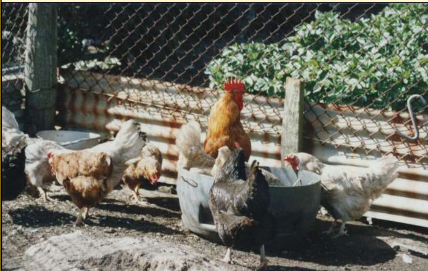
A typical Stanley chicken run

[F61; 152: AGR/LIG/1#6: FI Gazette 1922; 92: FIM Oct 1922: SHI/REG/4]