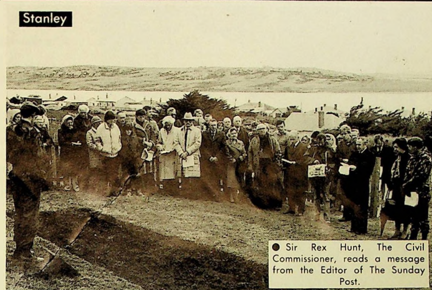
● Sir Rex Hunt, The Civil Commissioner, reads a message from the Editor of The Sunday Post.