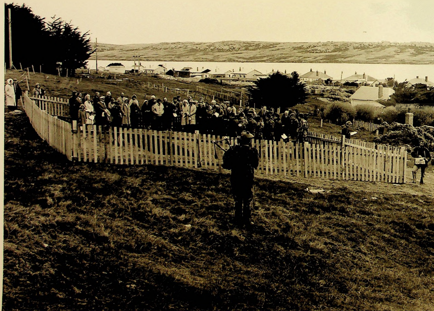
Stanley · 28 November 1982 · Edinburgh.