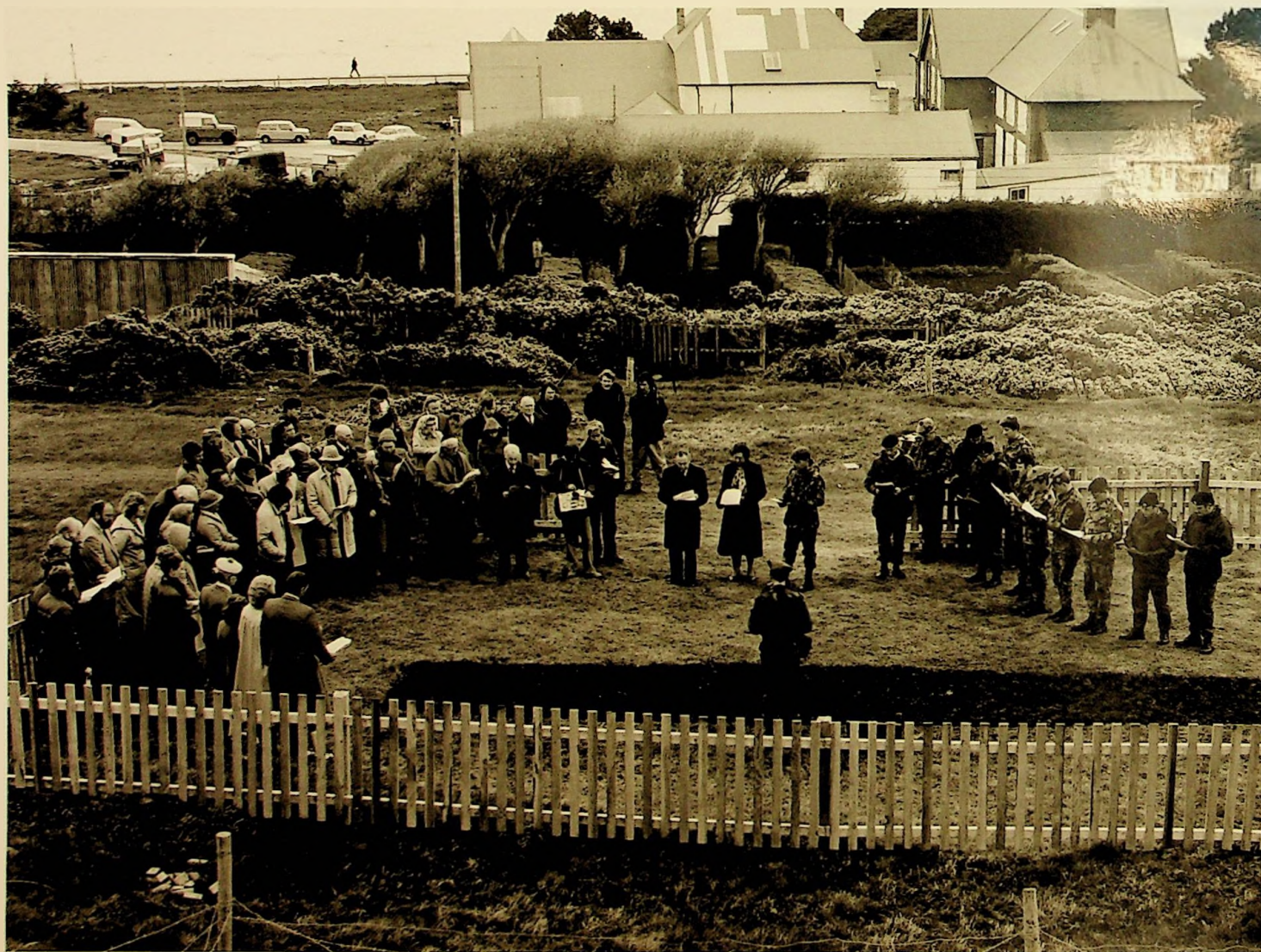
'White Heather' Memorial