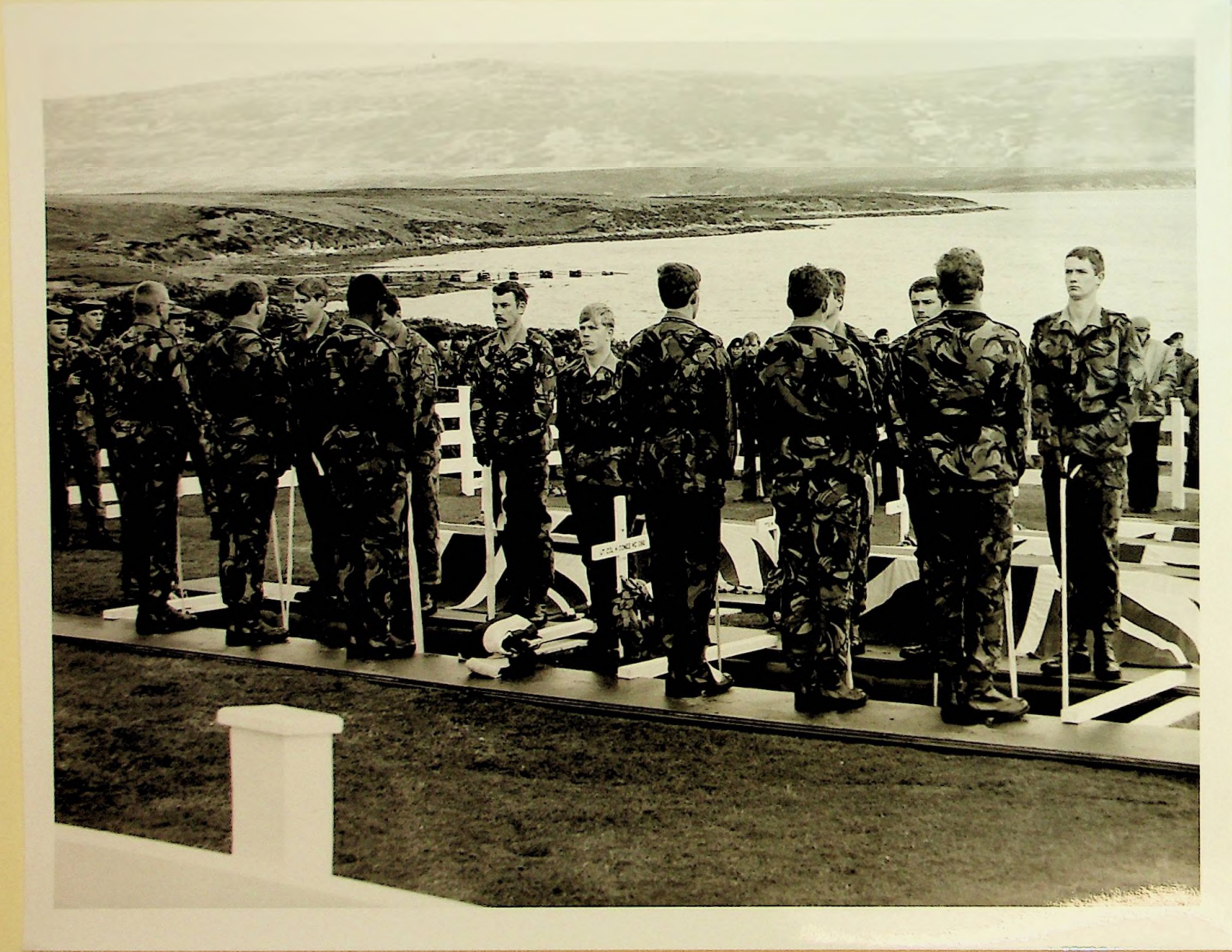
"The Bearer Party Royal Phoneer Corps.