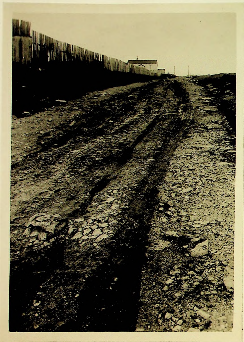
PHOTOGRAPH No. 4.

VILLIERS STREET. looking South, showing water course down centre of road.