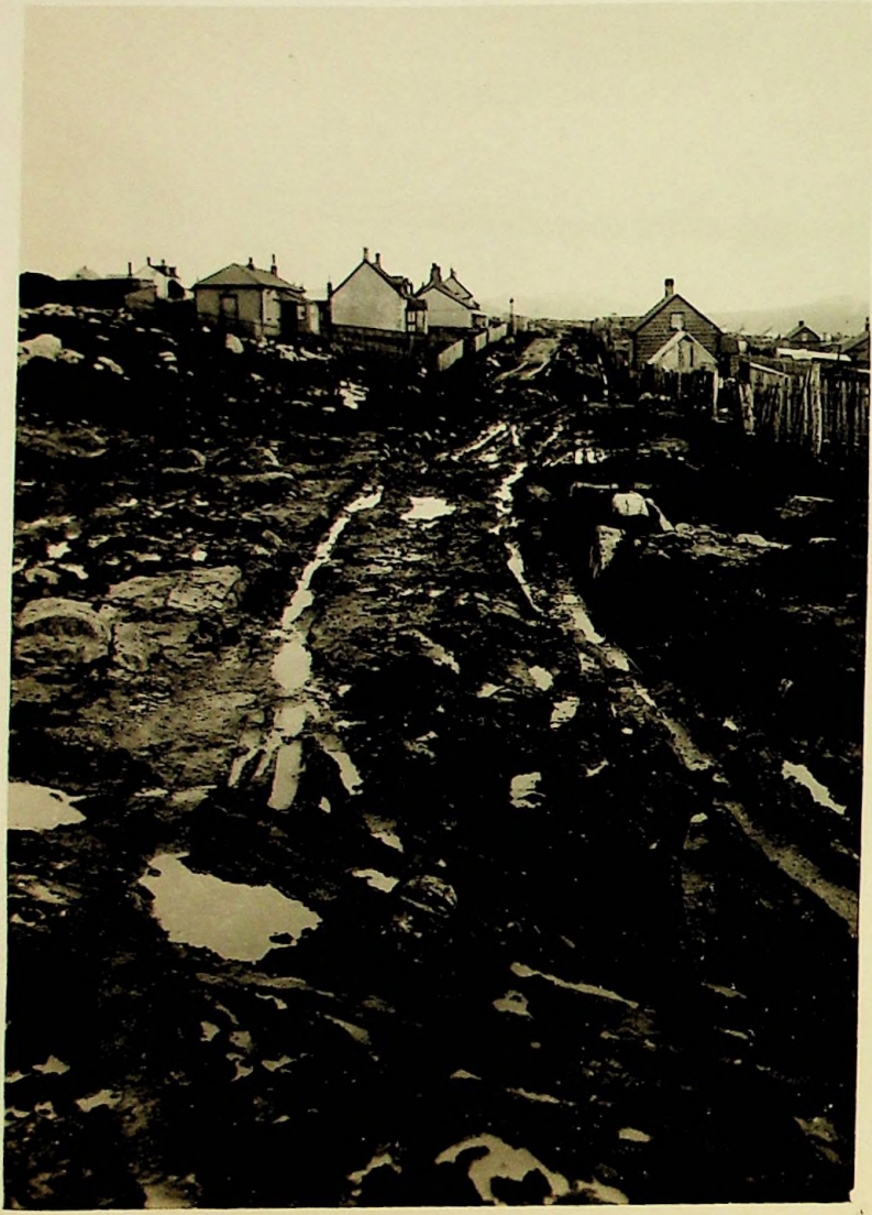
PHOTOGRAPH No. 5.