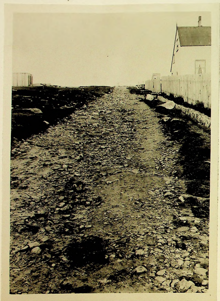
PHOTOGRAPH No: 2.