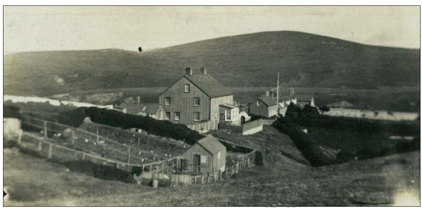
Roy Cove Big House - Clement Albums

On 20 August 1888 Crown Grant 333 was issued to William Wickham BERTRAND for £173-6-8 being the compulsory purchase of 1,733.3 acres on Roy Cove Station, Section 3. [CG 333]