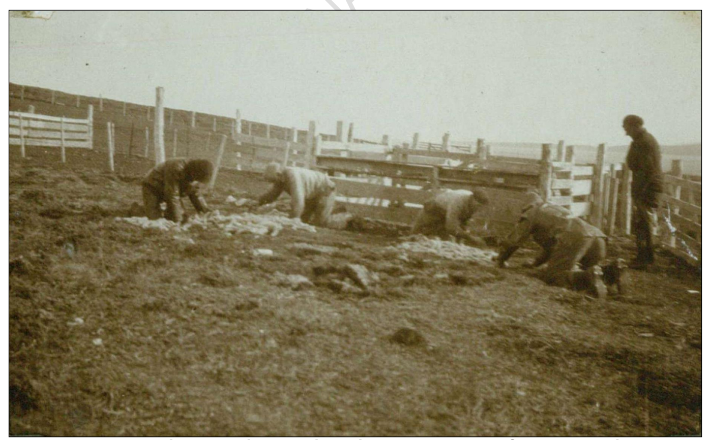
Bun, Jack, Vincent & Jim counting tails at Dunbar 1932. C Poole standing

Roy Cove was purchased from Bertrand & Felton Ltd by the Falkland Islands Government in July 1981 for £200,000 and sub-divided in 1982 into six sections: Boundary 9,173 acres; Crooked Inlet 13,654; Dunbar 14,891 acres; Hope Harbour 16,876 acres; Picthorne 11,684; Port North 8,738 acres.