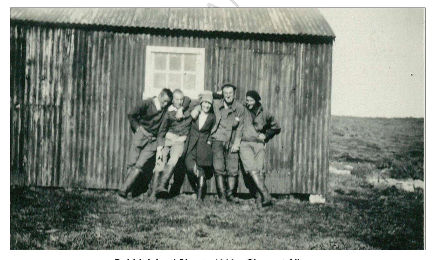
Rabbit Island Shanty 1929

On 5 February 1889 there were 4 houses in the Roy Cove settlement and 24 inhabitants. The Port North house was built overlooking Port North and had 2 adults and 5 children. The Dunbar House was built overlooking the sea and had 2 adults and 6 children. [H43; 52]