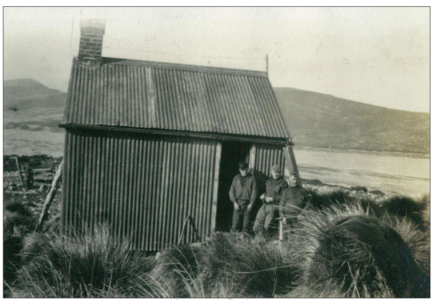
Bense Island Shanty 1928 - Clement Albums

On 5 February 1872 under the 10<sup>th</sup> clause of the Amalgamation Ordinance of the Lease of Crown Lands of 1870 William Wickham BERTRAND transferred the portion of land bounded "on the South East by Station Nos. 6 & 7 from Teal River to River Harbour. Thence on the North and North East by the shores of River Harbour, Rock Harbour, Port Egmont and Byron Sound to Hill Cove. Thence by a line running South 39° West to the North East arm of Crooked Inlet, and containing 109,720 acres more or less, together with Tussac Island and Middle Island, and other small islands as delineated by a line of demarcation inscribed on the Chart recorded in the office of the Surveyor General" to Messrs HOLMESTED and REES who were granted a lease for 21 year from 5 February 1871 at an annual rent of £111 for the first 10 years and £184 for the remainder. [BUG-REG-2; 277]