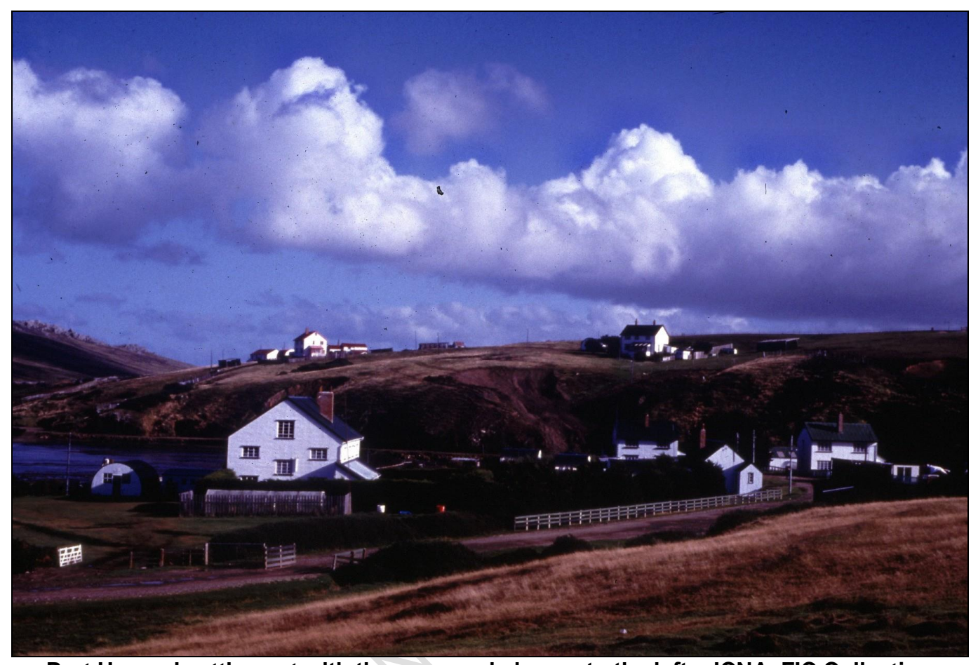
Port Howard settlement with the manager's house to the left

On 30 August 1937 Crown Grant 480 was issued to James Lovegrove Waldron Ltd for £20,724 being 138,160 acres known as Port Howard Station comprising of Section 1 White Rock Station; Section 4A Mount Moody Station, containing 141,920 acres more or less, less 3,760 acres compulsorily purchased under CG 337, 338 & 339. [CG 480]