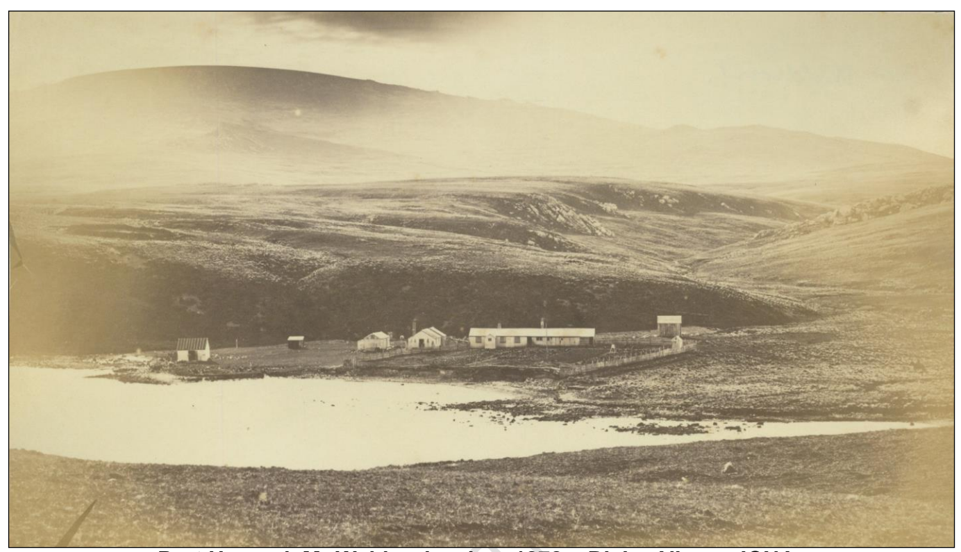
Port Howard, Mr Waldron's, circa 1878

for 7 miles; on the North West by Station No 5, one miles; on the South East by a stream running South East, 2 miles to a chain of ponds running North East till it cuts the North East boundary which runs in a South East direction to Hill Gap." [BUG-REG-2; pg 284: BUG-REG-3; pg 149]