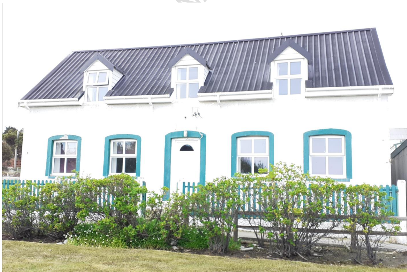
From the north, 2021 - JCNA