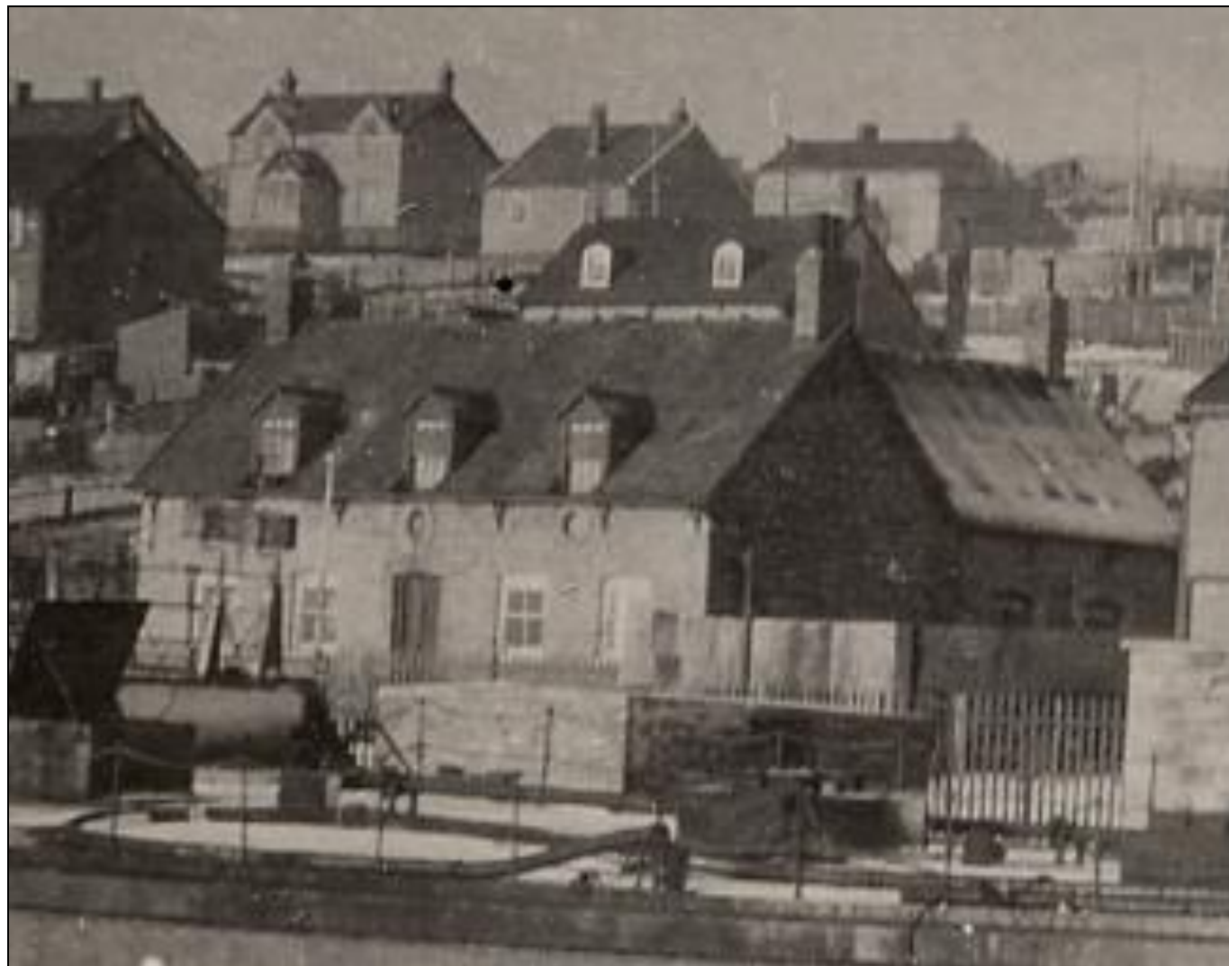
From the north west, showing the decorative brick circles under the dormer windows Possibly circa 1933