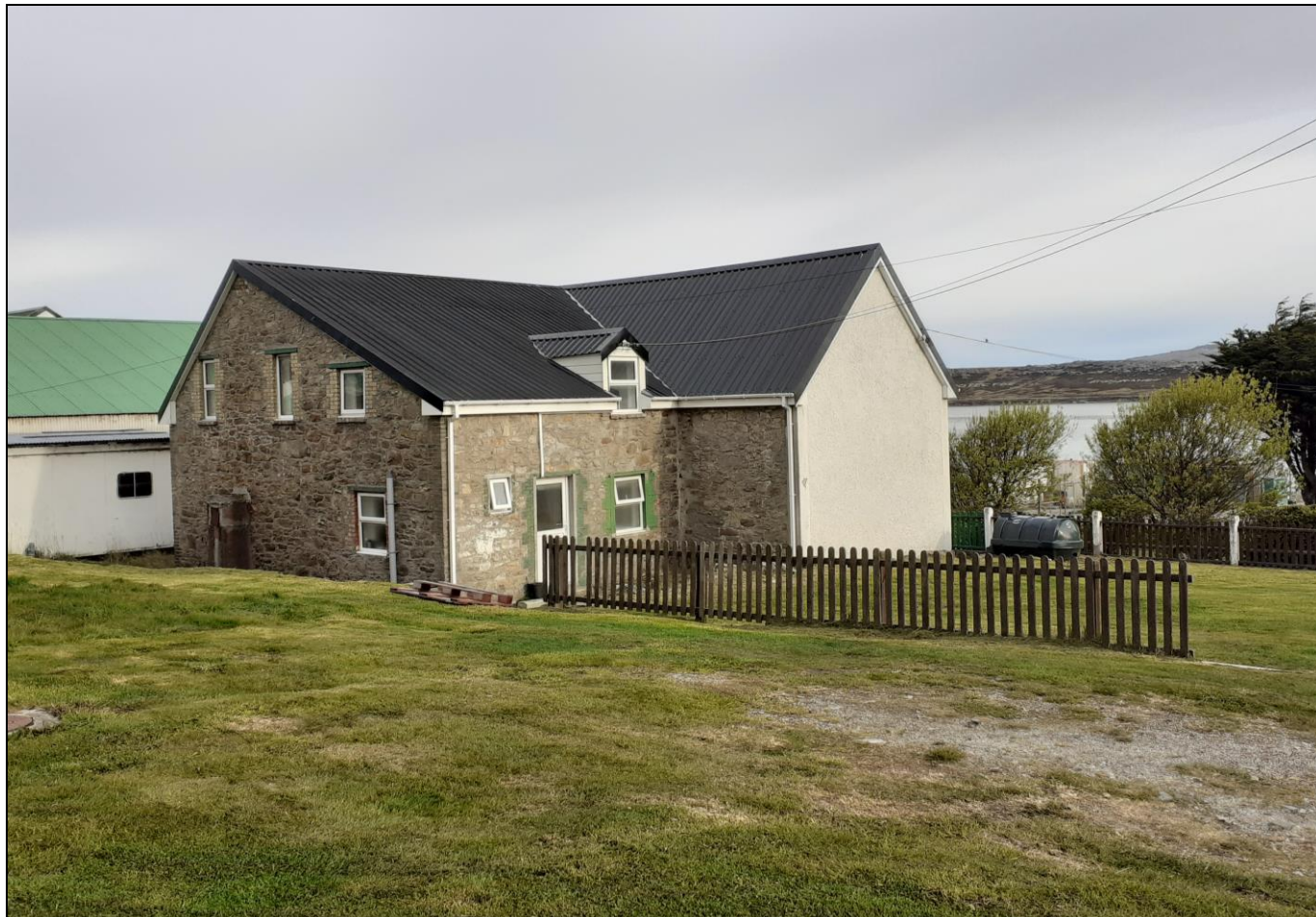
From the south east, 2021 - JCNA