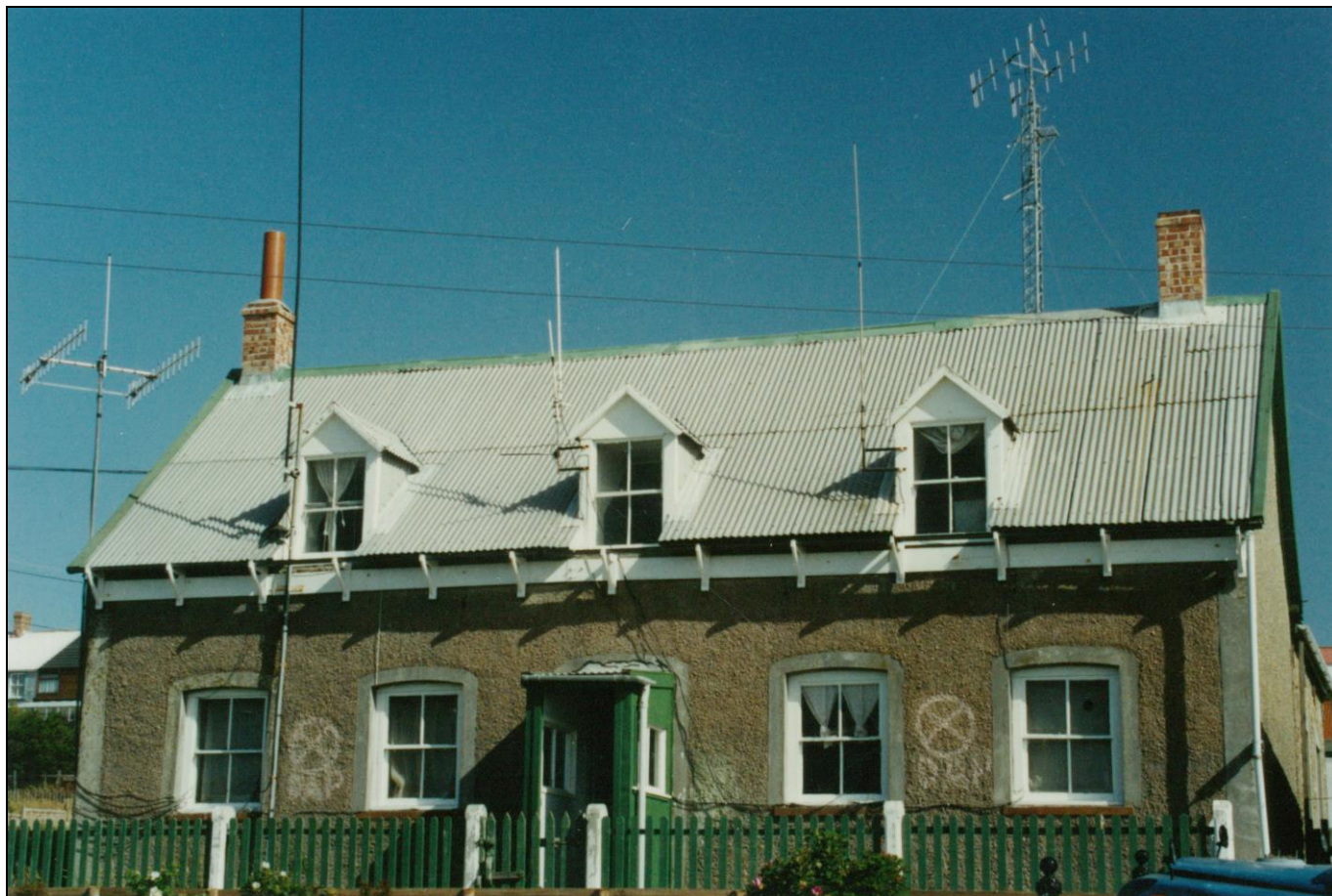
From the north, 1993 - JCNA