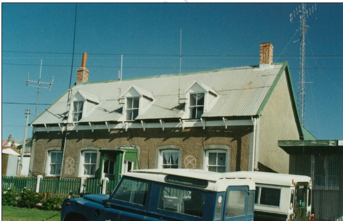
From the north west, 1993 - JCNA