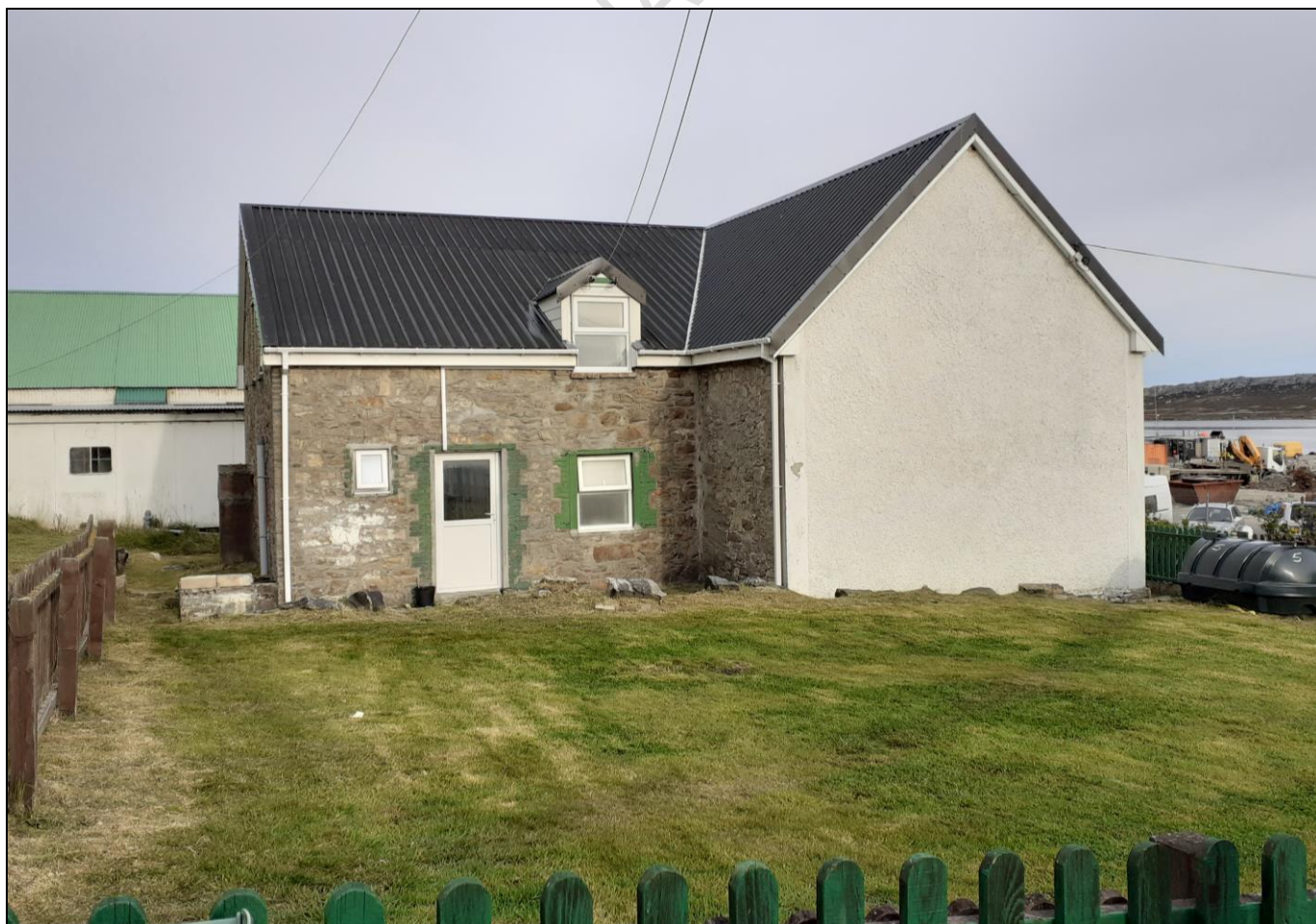
From the east, 2021 - JCNA