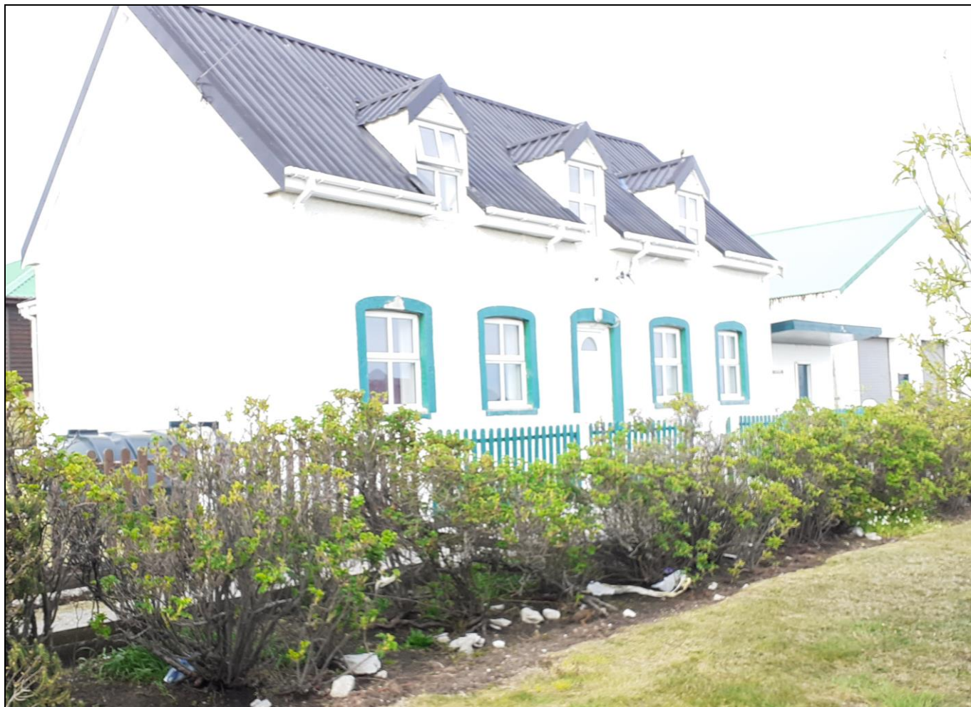
From the north east, 2021 - JCNA