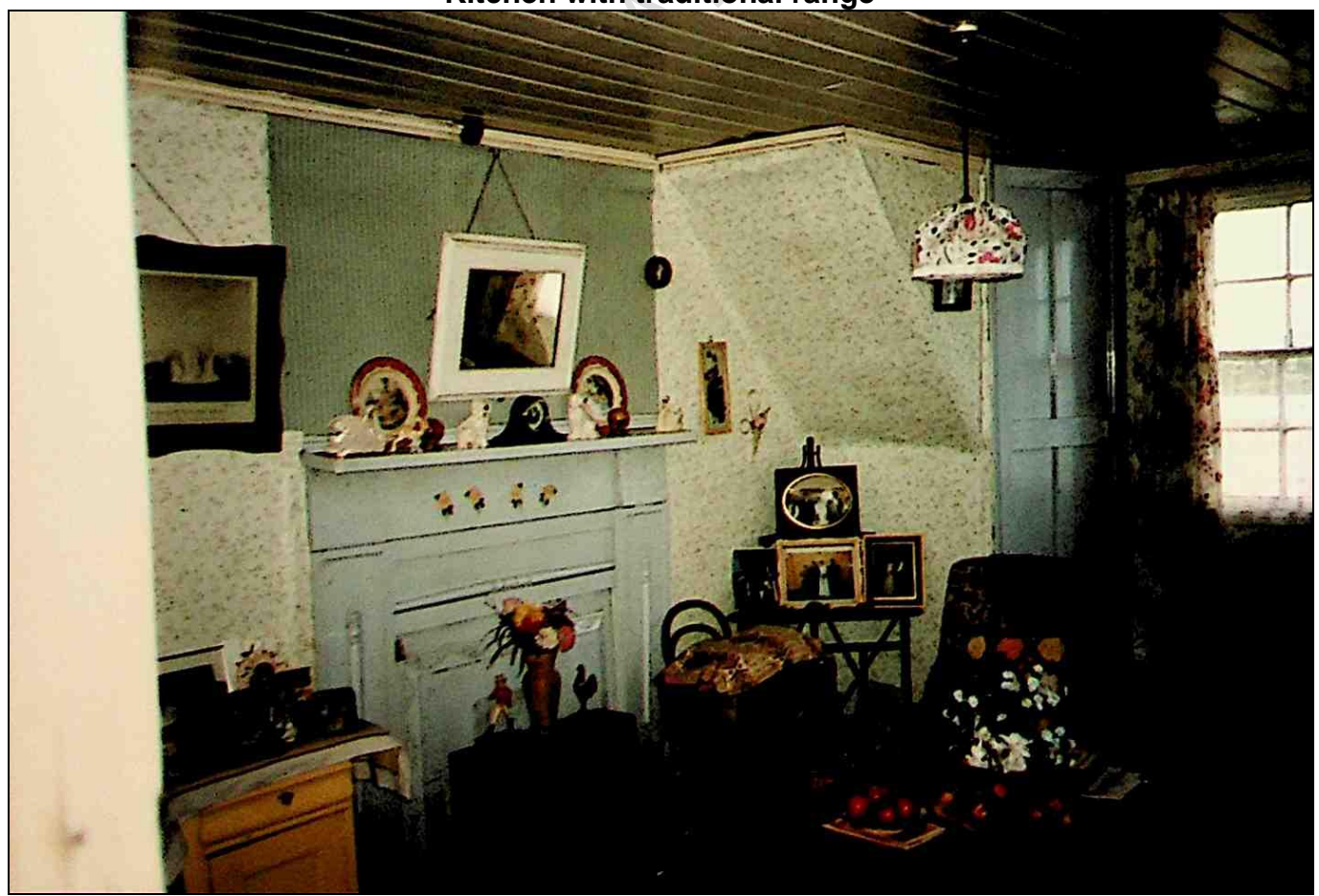
Lounge with door to stairs next to the window