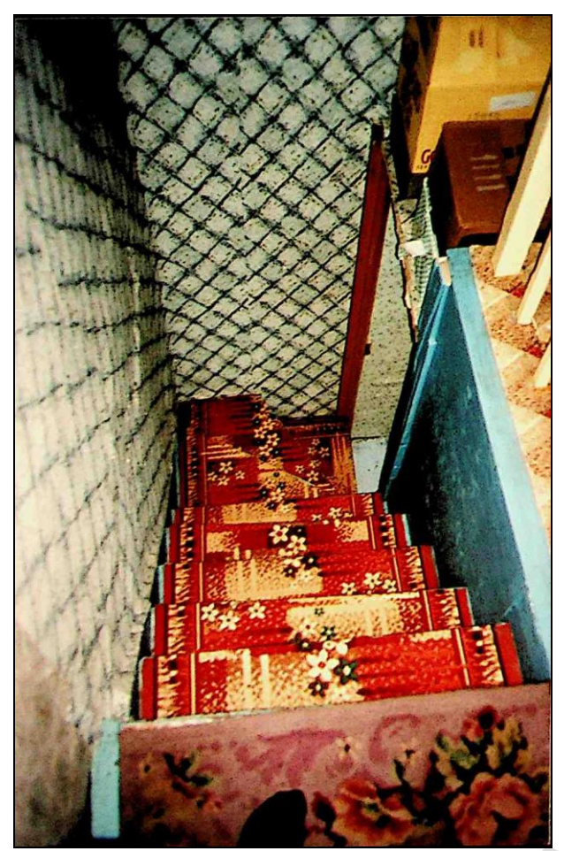
Looking down the stairs