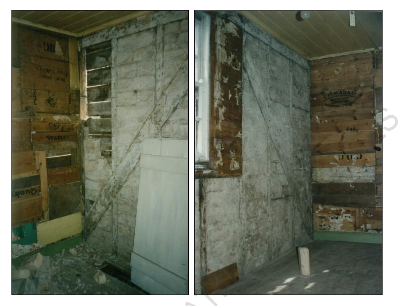
Wall coverings stripped away to expose lining material used