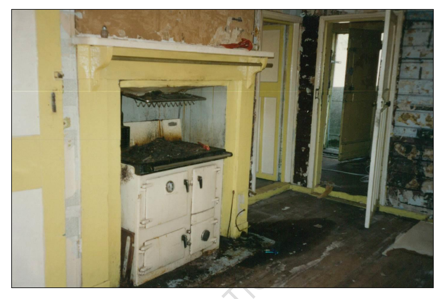
Original range being before and after removal and exposing of chimney breast