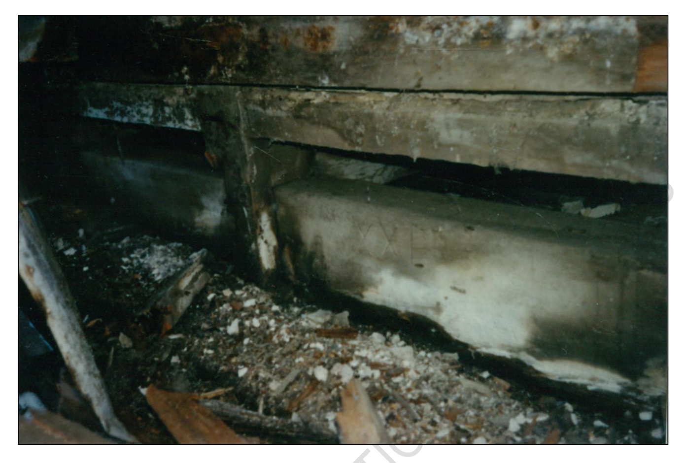
Original beams of the kit house showing the Roman numerals, etc