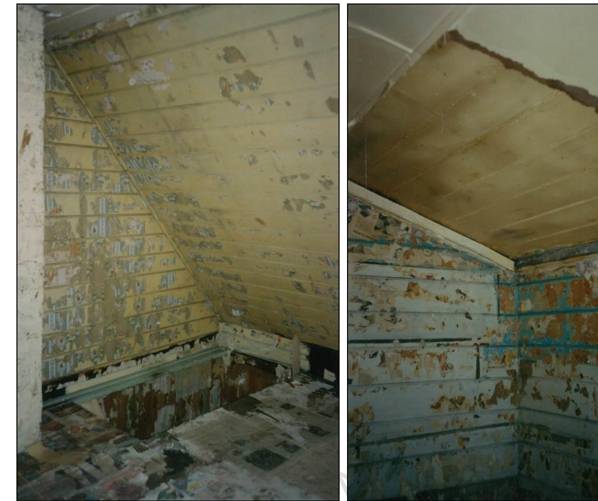
Top of stairs in the first bedroom