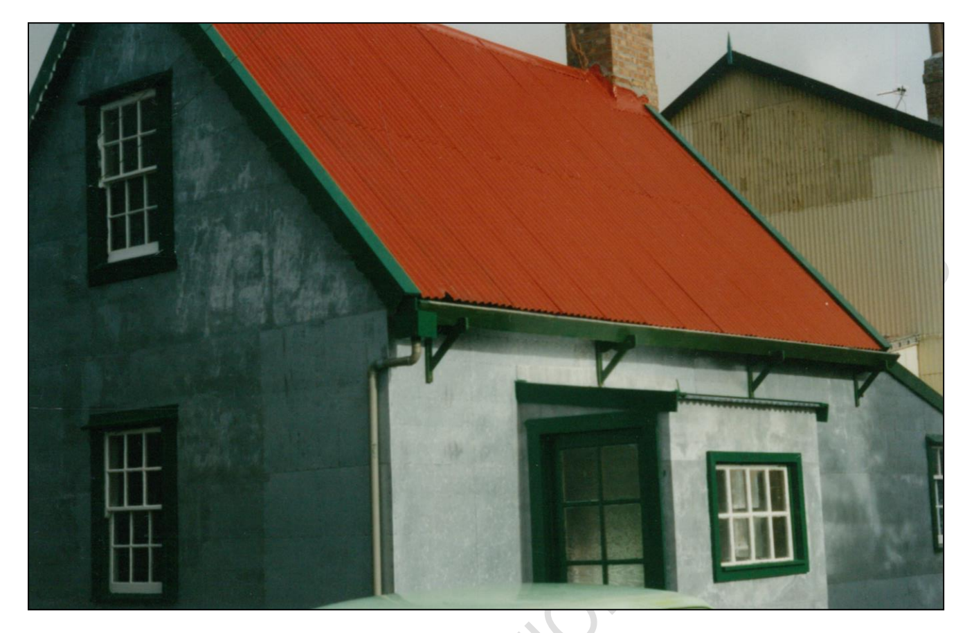
Above 1994, below 2019