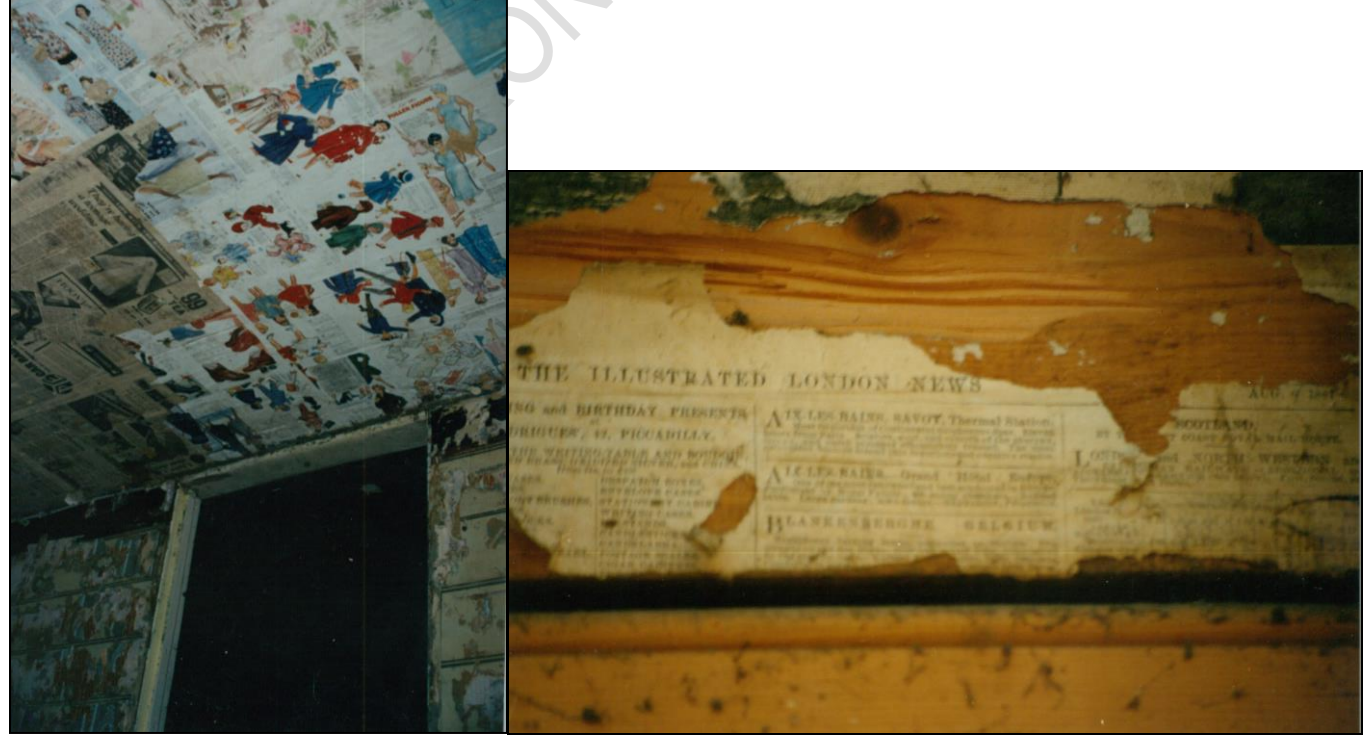
Old catalogues and newspapers used to line the walls