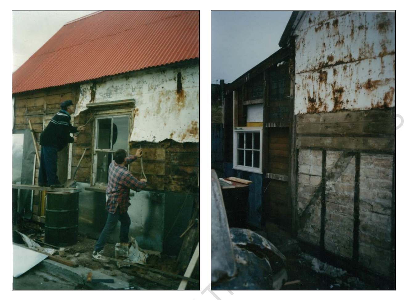
Old tin cladding being stripped off to make way for new