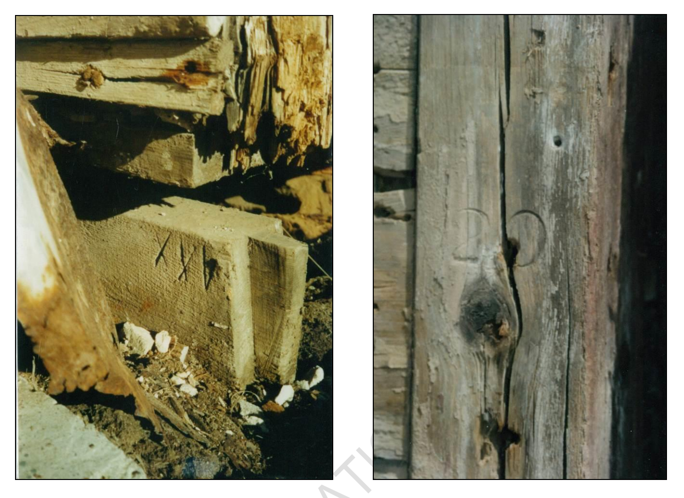
Original beams of the kit house showing the Roman numerals, etc