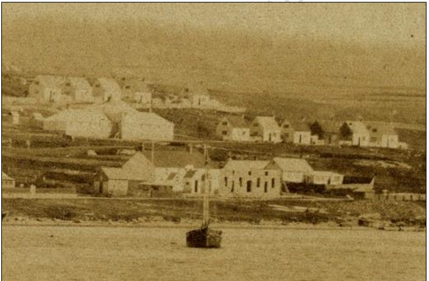
1863 – Fourth house from right, top row