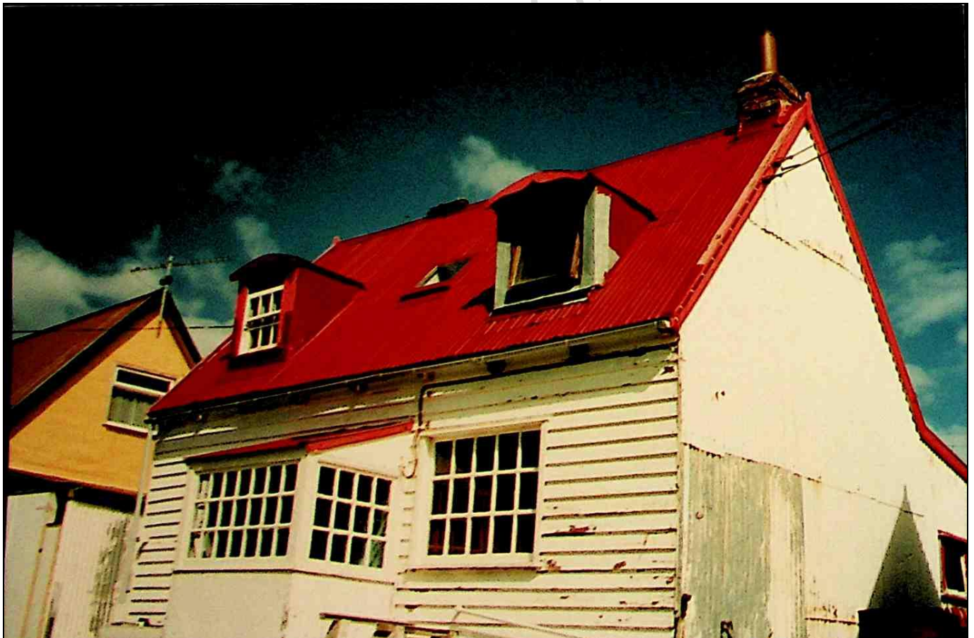
1992 - JCNA

On 14 June 1943 Axel Richard August PETERSSON granted William Phorsen HILLS No 9 Pensioners Cottage Allotments, containing 24 poles and bounded “ on the North by Drury Street 60 links, on the West by Lot 10 250 links, on the South by Pioneer Row 60 links on the East by Lot 8, 250 links with all houses, fences and erections thereon ” for £625. [BUG-REG-11; 326]