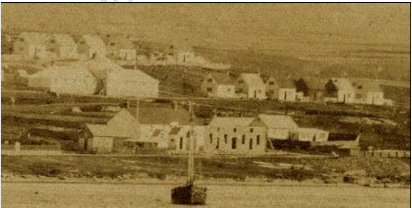
1863 – Fourth house from right middle row