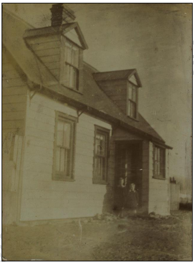
Fair View Cottage 1915

On 1 January 1917 Fair View Cottage was insured for £80.