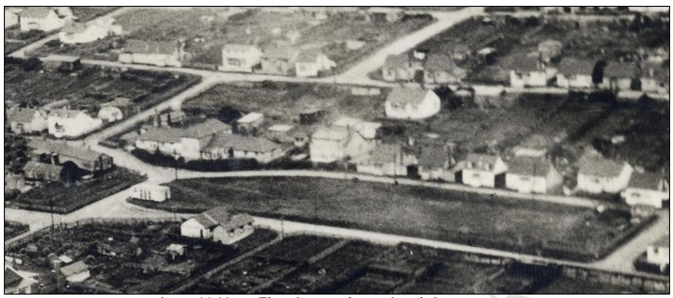
Late 1940s - First house from the right, top row