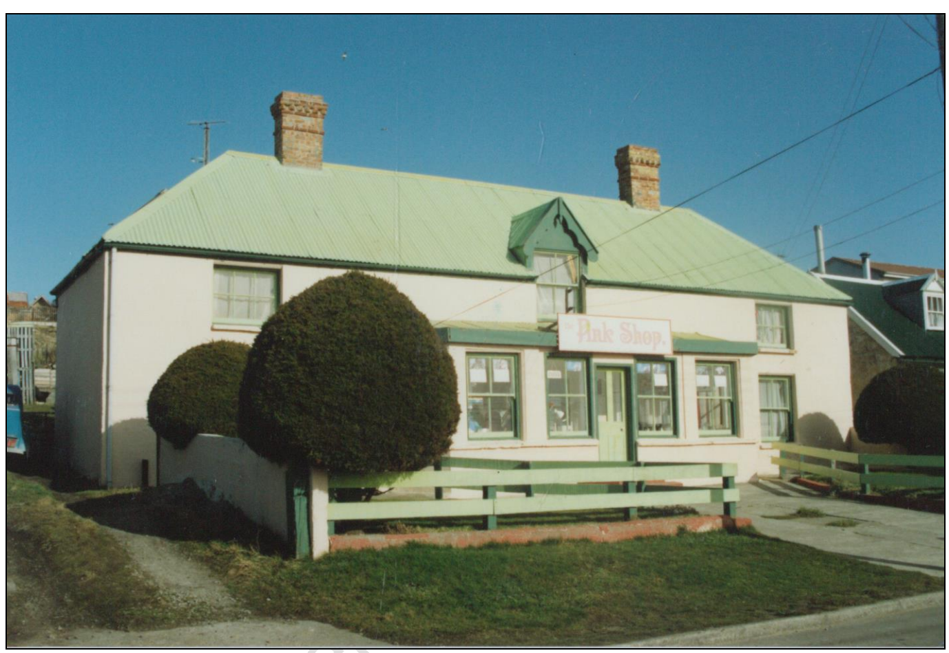
33 Fitzroy Road 1992 - JCNA

In June 1976 33 Fitzroy Road belonged to Mr & Mrs E COFRE of Weddell Island and consisted of six bedrooms, lounge, kitchen and bathroom as well as a garage and workshop on approximately quarter of an acre of land. They offered it to the Falkland Islands government for £4,500. The report by PWD advised purchasing the house due to extreme dampness, rotted, floor boards, joists and joinery, and old lead wiring which needed complete renewal. [HOU/1#6]