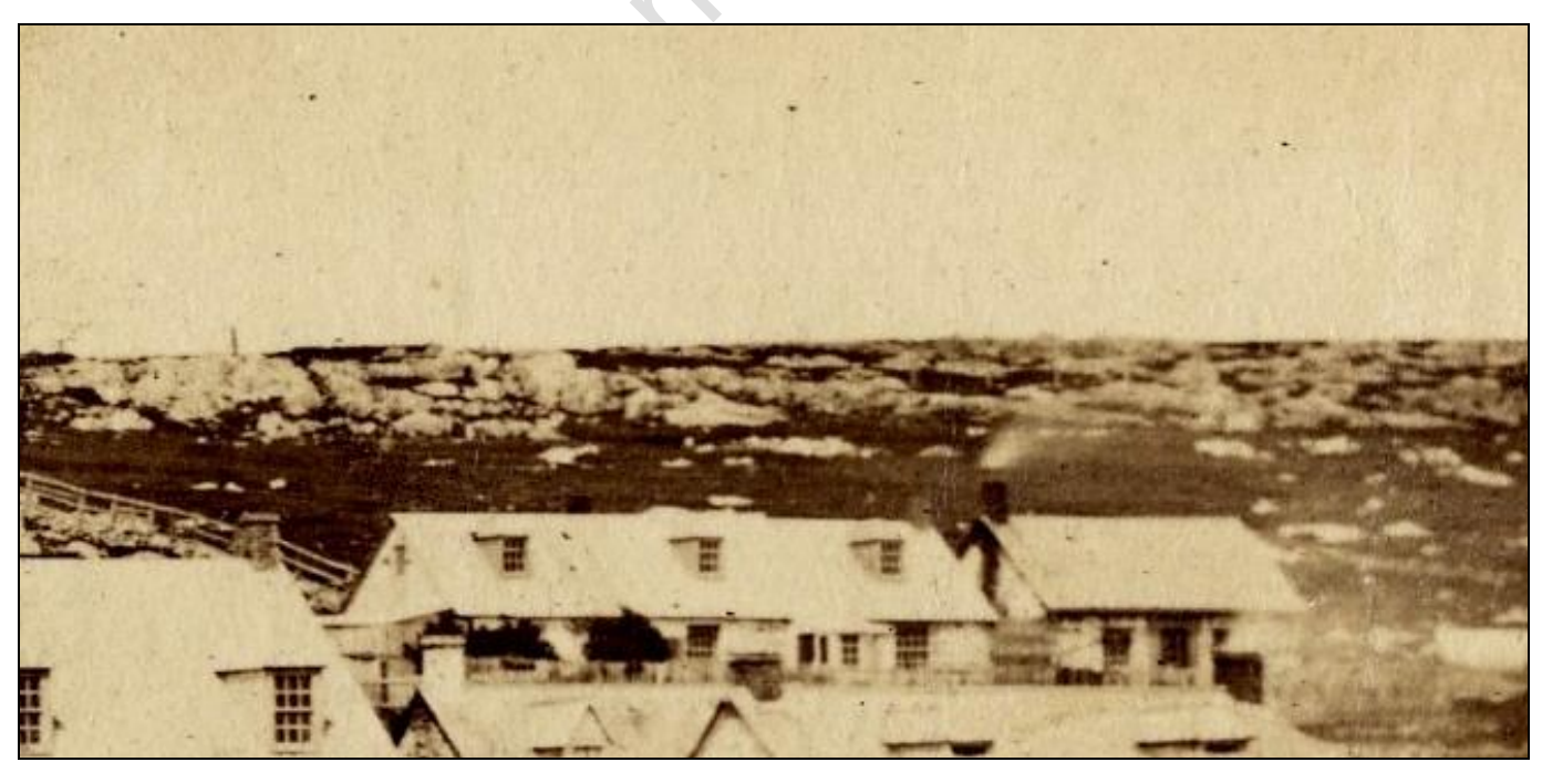
L-R (east to west) to rear: 33 Fitzroy Road and 31 Fitzroy Road, December 1878

On 28 October 1865 Thomas JARVIS , publican of Stanley, and his wife Bridget granted to Andres PITALUGA of Port Salvador, one acre of land being "All that parcel of Land in the Falkland Islands situate in the suburbs of Stanley having a frontage of 139 links to the Fitzroy Road" for £322. [BUG/REG/1; 289]