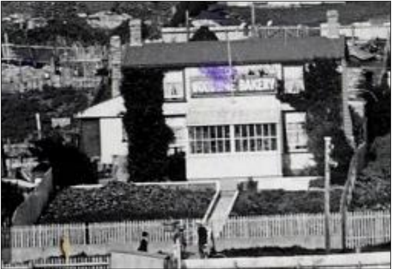
The Woodbine Bakery with the Virginia creeper or Woodbine vine up the sides, 1927

On 10 February 1943 John Falkland SUMMERS of Stanley granted to Aubrey Vernon SUMMERS of Stanley the North East corner of Lot No 5 for 5 shillings bounded " on the North by Fitzroy road forty seven feet (47 ft) from Lot No 4 and West by a line running South Two Hundred and forty feet (240 ft) and then by a line running East forty seven feet (47 ft) to lot No 4. Together with all buildings fencings and erections whatsoever thereon. " [BUG/REG/11; pg 319]