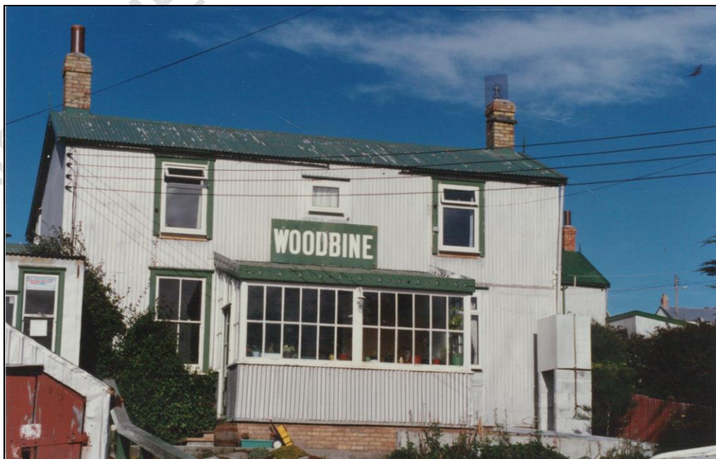
1991 - JCNA

On 10 February 1943 John Falkland SUMMERS of Stanley granted to Aubrey Vernon SUMMERS of Stanley the North East corner of Lot No 5 for 5 shillings bounded " on the North by Fitzroy road forty seven feet (47 ft) from Lot No 4 and West by a line running South Two Hundred and forty feet (240 ft) and then by a line running East forty seven feet (47 ft) to lot No 4. Together with all buildings fencings and erections whatsoever thereon. " [BUG/REG/11; pg 319]