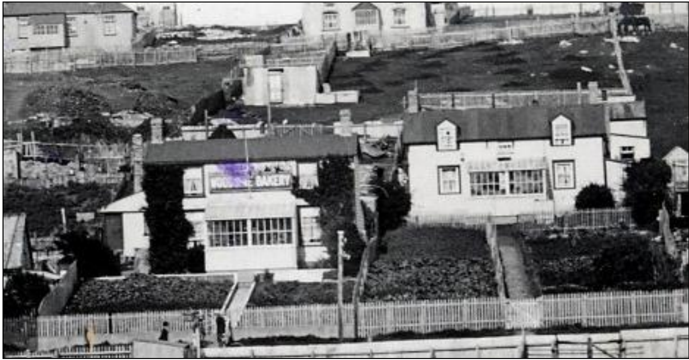
L-R (east to west) 29 Fitzroy Road, and 27 Fitzroy Road 1927 – FIC Collection, JCNA