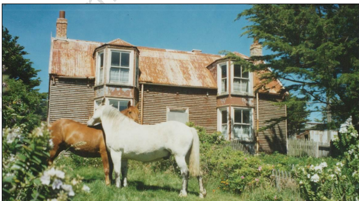
1992 - JCNA