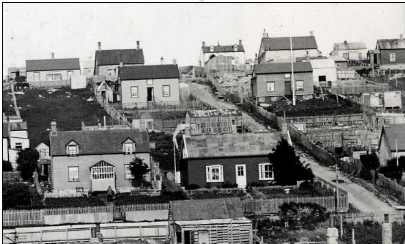
L-R: 25 Fitzroy Road and 23 Fitzroy Road a single storey building, 1927