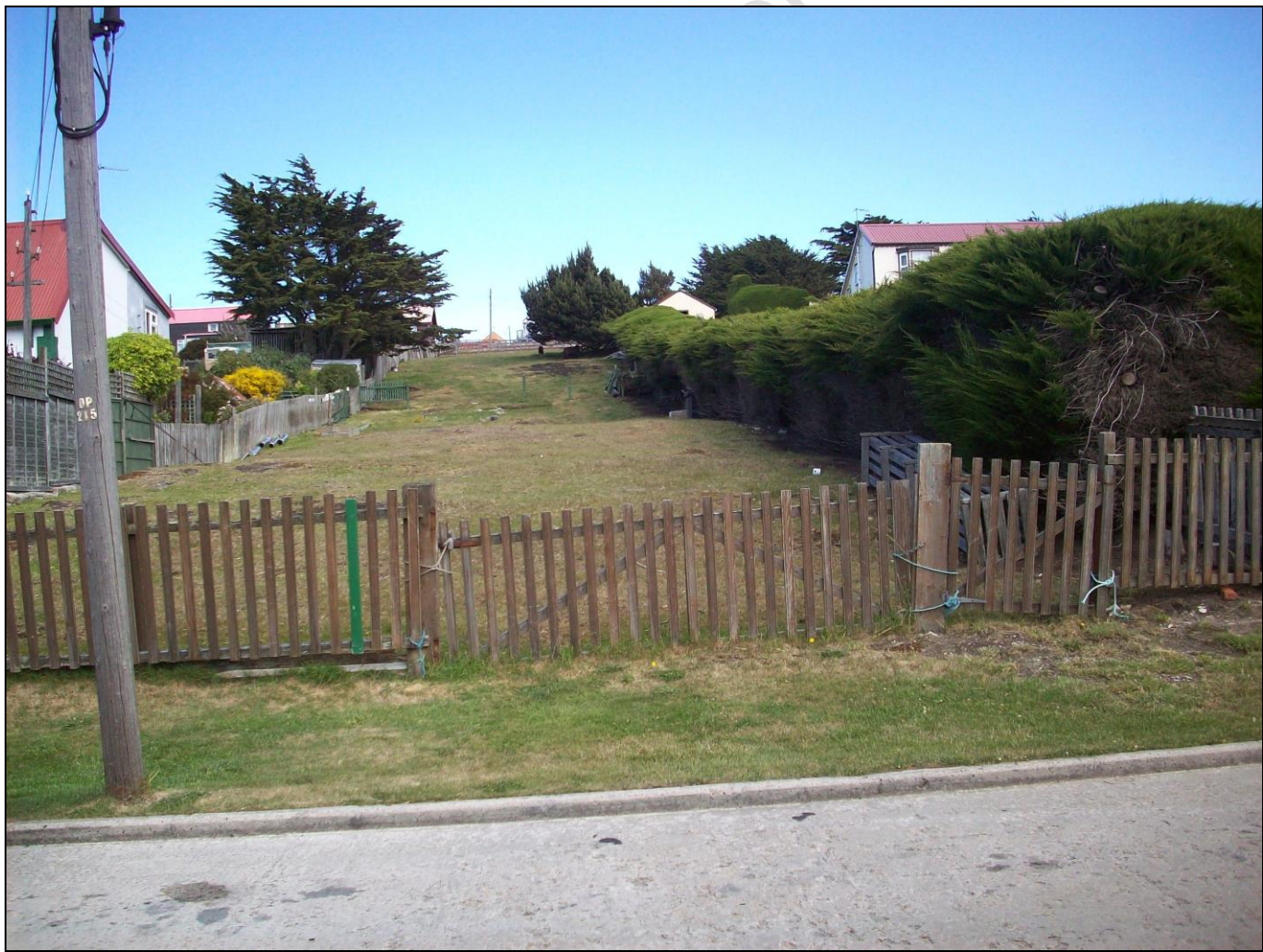
2016 - JCNA