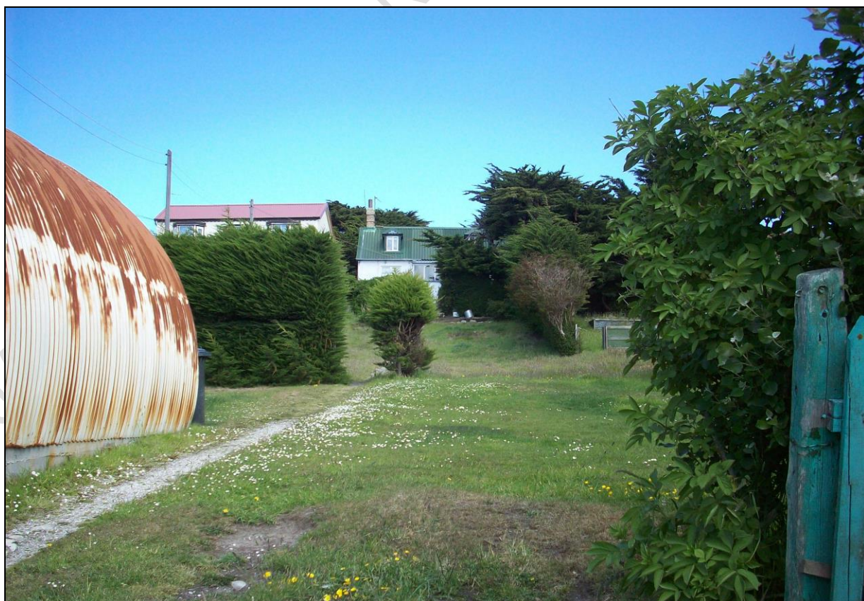
11 Fitzroy Road, 1993 - JCNA