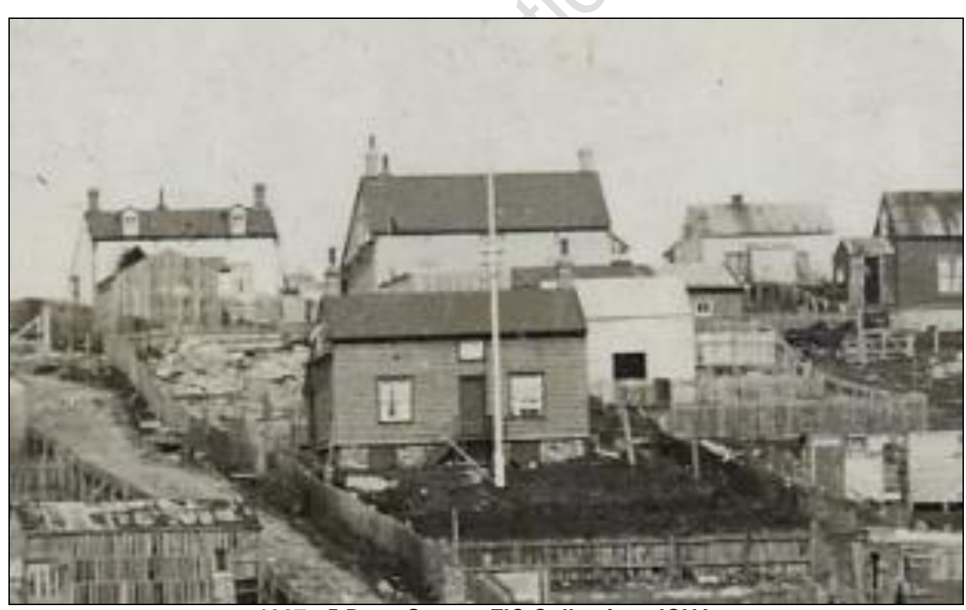
1927 - 5 Dean Street - FIC Collection, JCNA