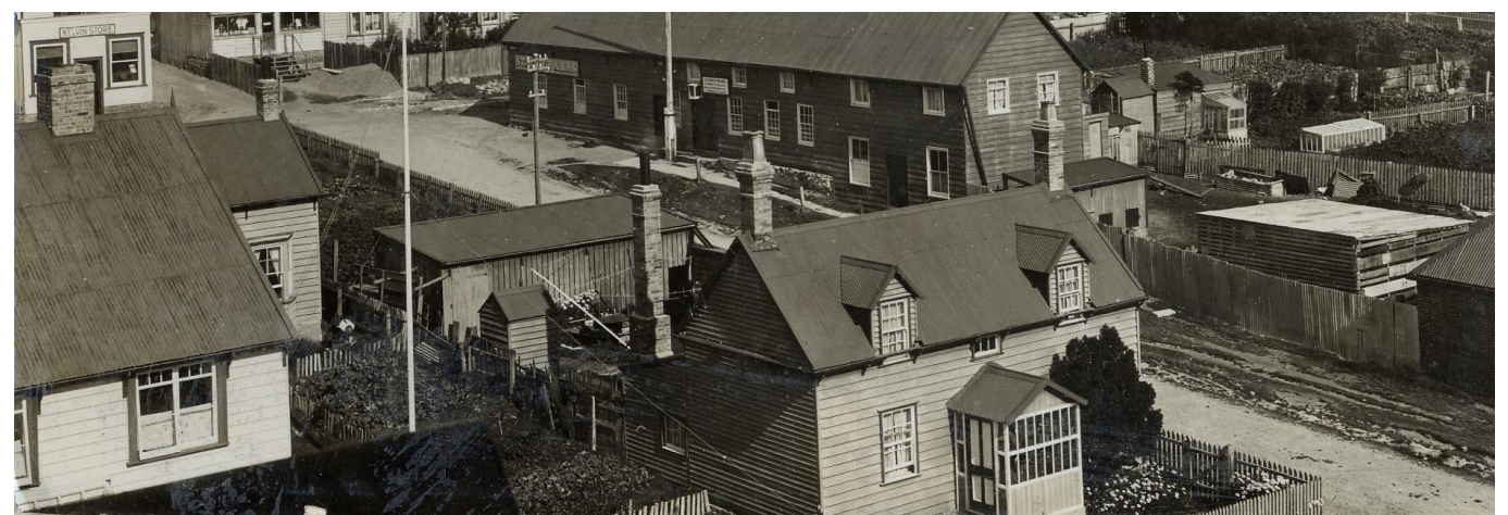
Early 1927 – L-R: Corner of Church House, garden now where McIntosh's house stood, Bott's or Hannaford's House

By 1927 the original house had been demolished and the house which stands today was built.