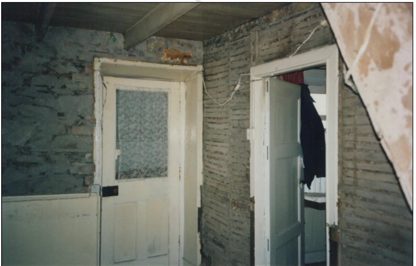
Exposed stonework and lining and insulation, photograph circa 1990 - JCNA