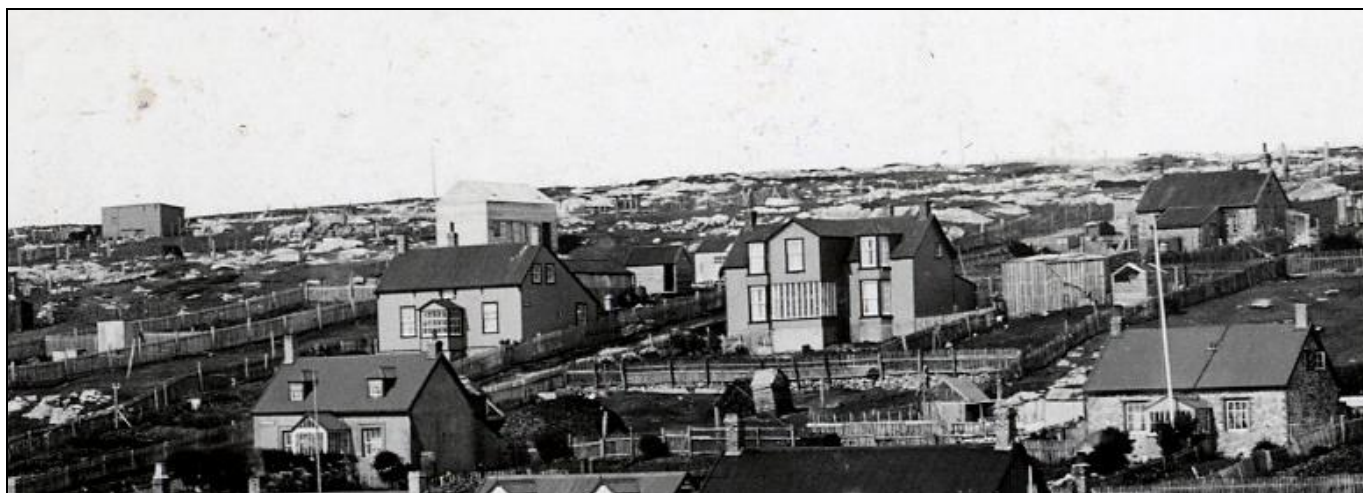
1927