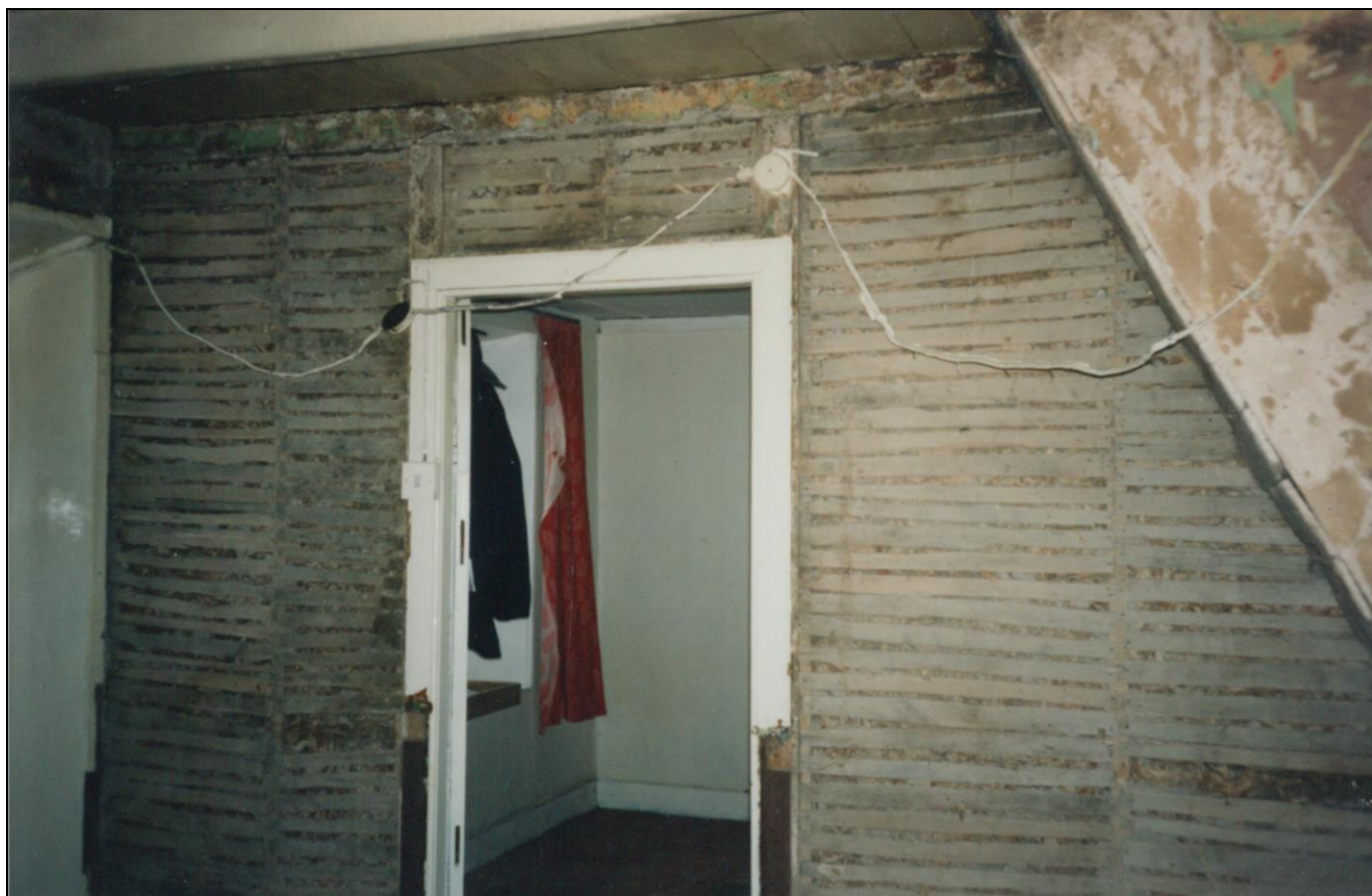
Lining and insulation, photographs circa 1990 - JCNA