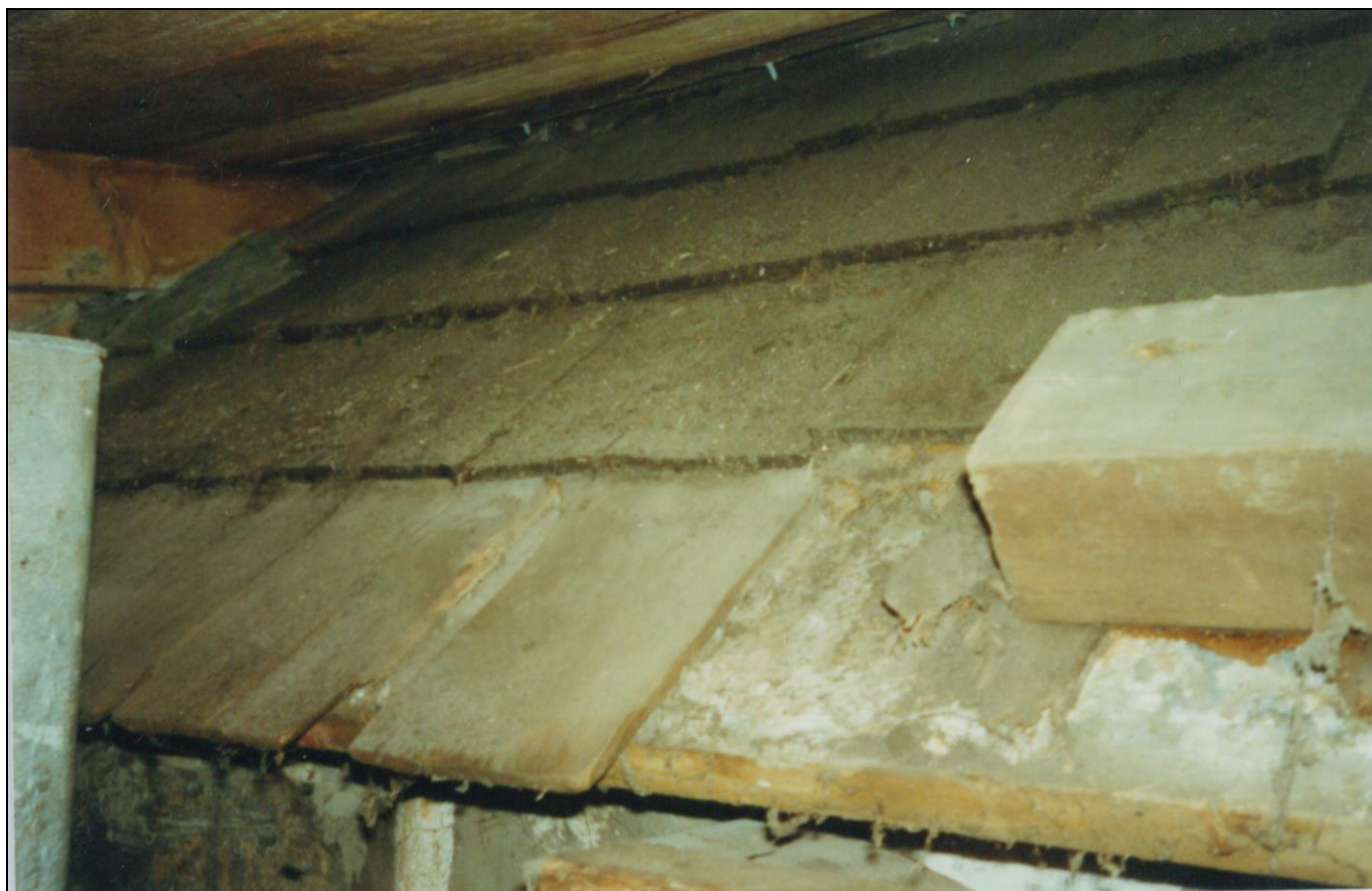
Original roof under extension, photographs circa 1990 - JCNA