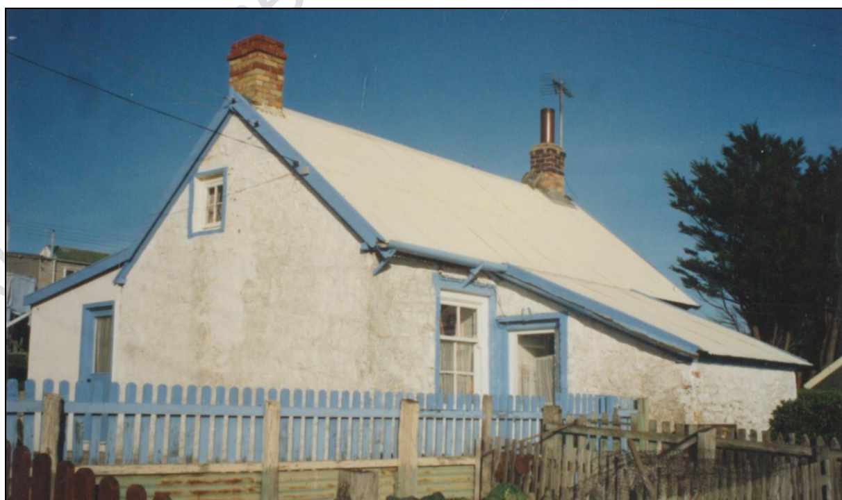
Circa 1990