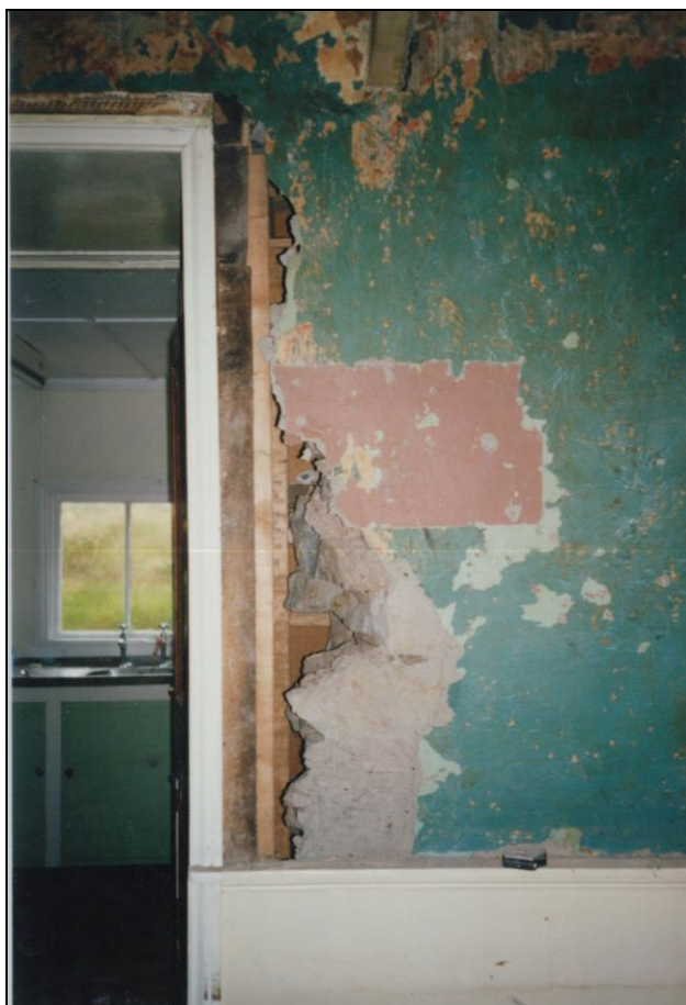
Clockwise from top left: fireplace, door into kitchen extension, staircase up, looking down staircase, photographs circa 1990