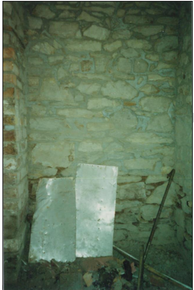
Attic bedroom and exposed stonework, photographs circa 1990