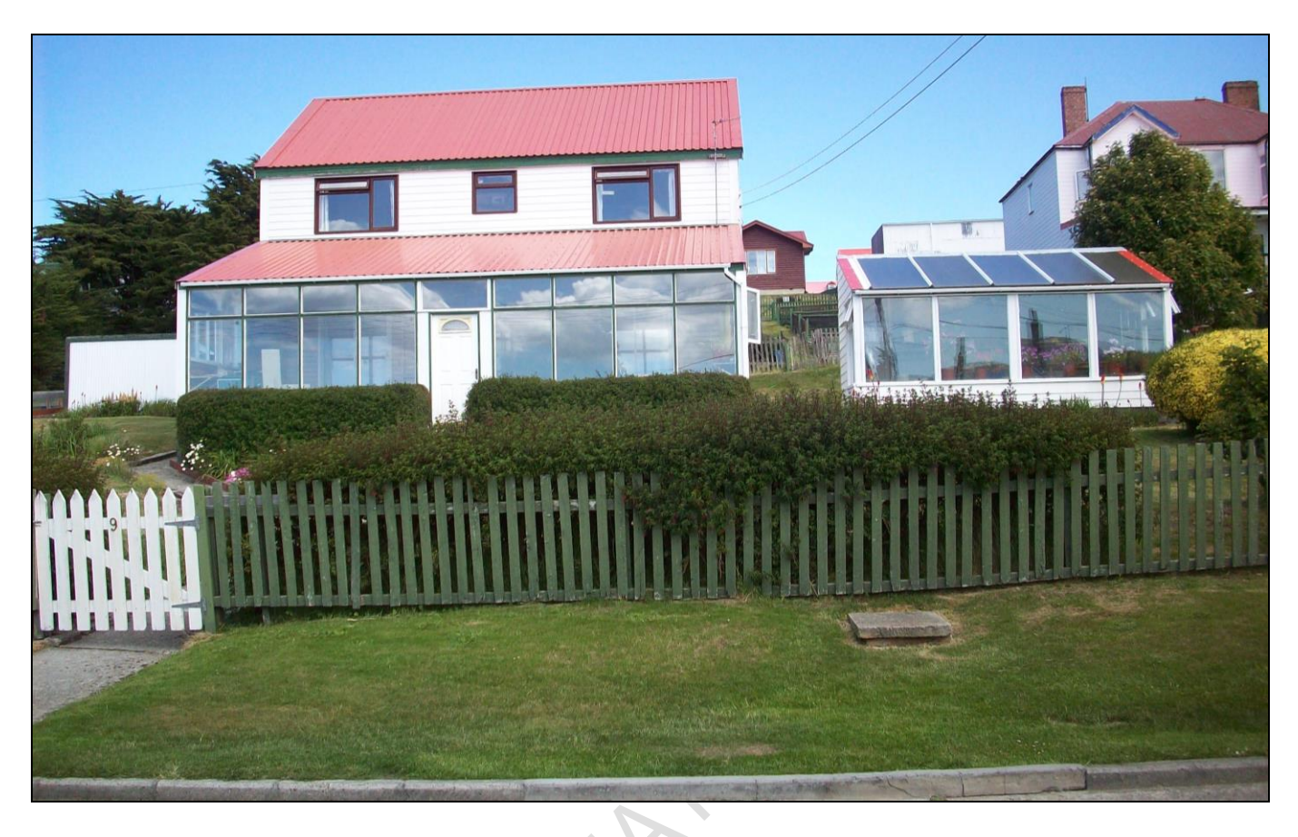
9 Fitzroy Road, 2016 - JCNA

In 1944, 9 Fitzroy Road consisted of a house and garage, had a rateable value of £52 and was occupied by the owner, Mrs E DAVIS. [BUS/RAT/2#1]