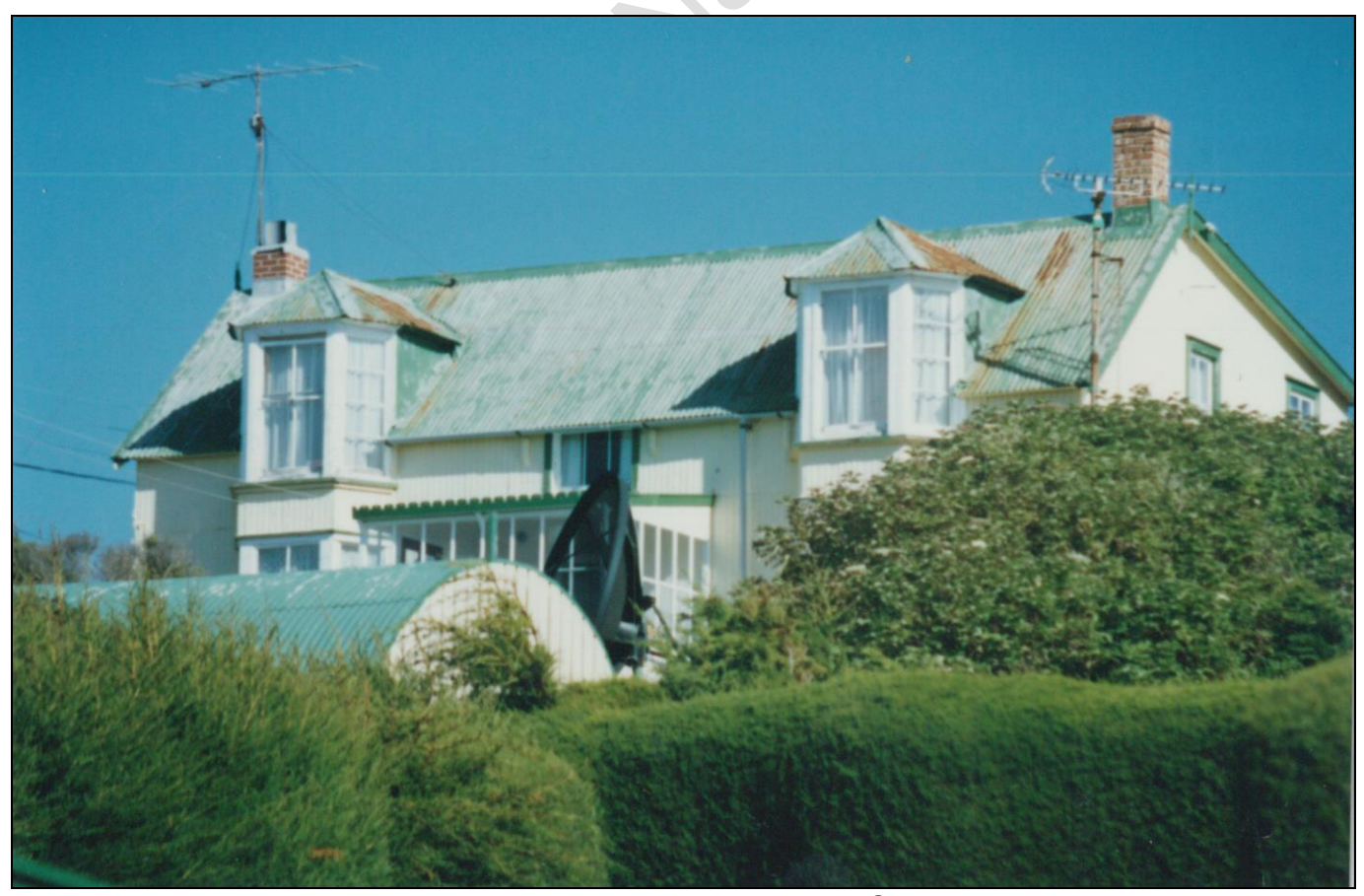
From the north west, 1994 - JCNA