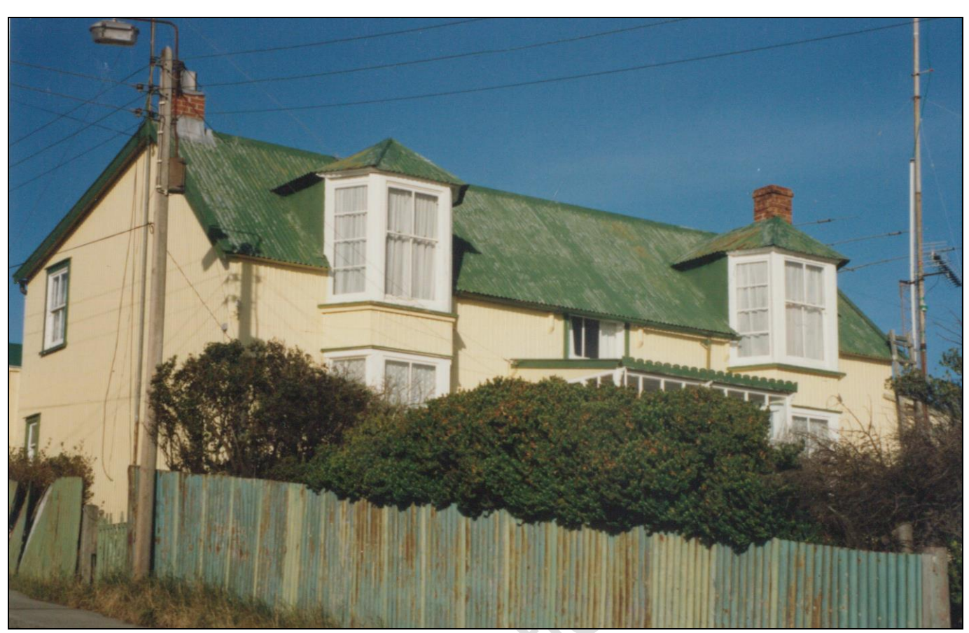
From the north east - JCNA