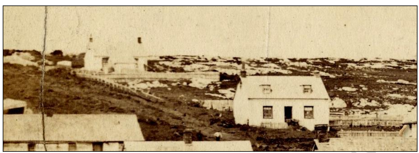
Dec 1878 after the peat slip, top 9 Philomel Street, front 5 Philomel Street

In 1891, for tax purposes, the Primrose Villa was valued at £30. [FI Gazette]