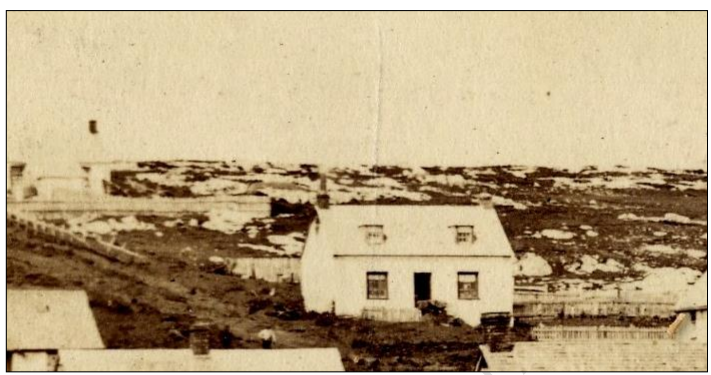
Dec 1878 after the peat slip

On 10 July 1883 John CASEY , stone mason of Stanley, granted to his brother-in-law, Edward NILSSON , mariner of Stanley, the northern portion of Lot 1 Suburban Section 1 containing one rood 38 perches and bounded "on the North by the Fitzroy Road 139 ½ links on the East by a Government Road 354 links on the South by a passage 12 feet wide 139 ½ links on the West by Lot No 2 of the same Sect 354 links. Together with the dwelling house and all other erections thereon" for £300. [BUG-REG-3; 178] - 5 Philomel Street