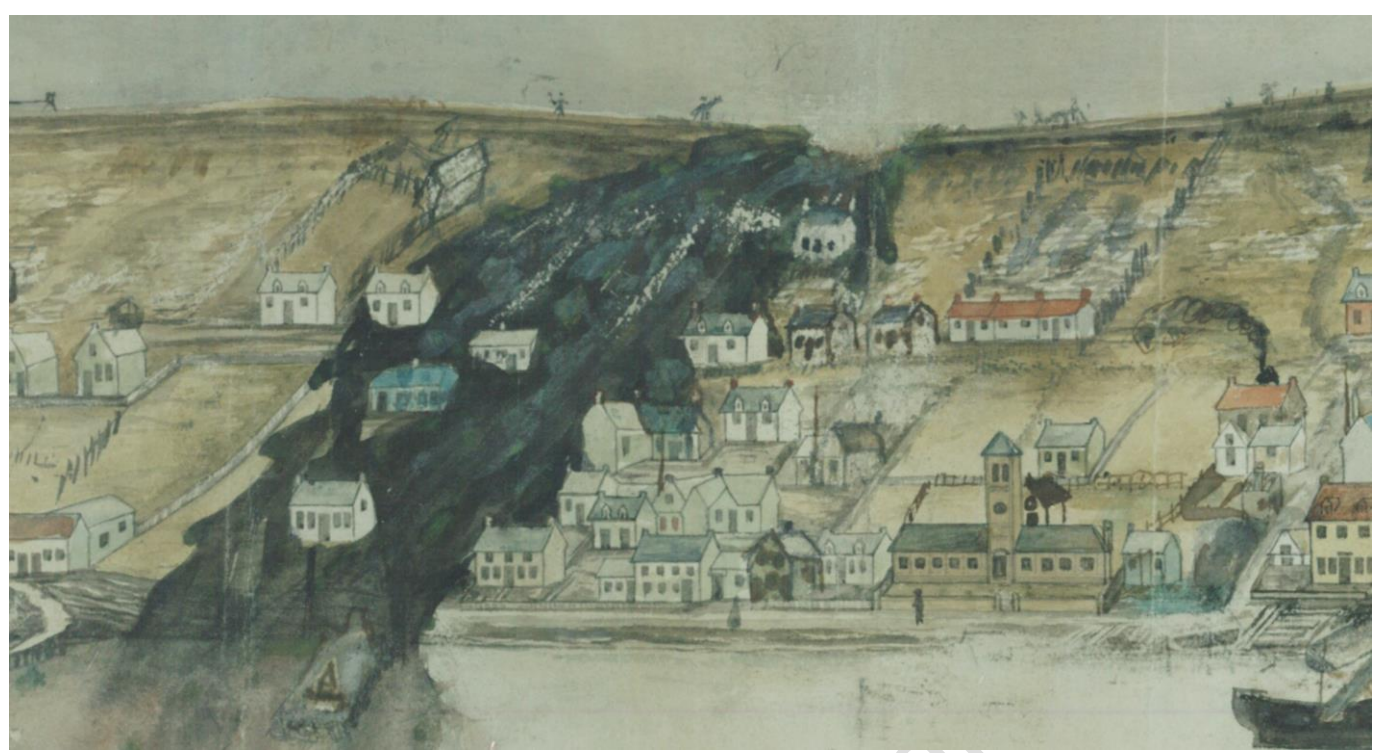
12 December 1878 - FIC Collection, JCNA