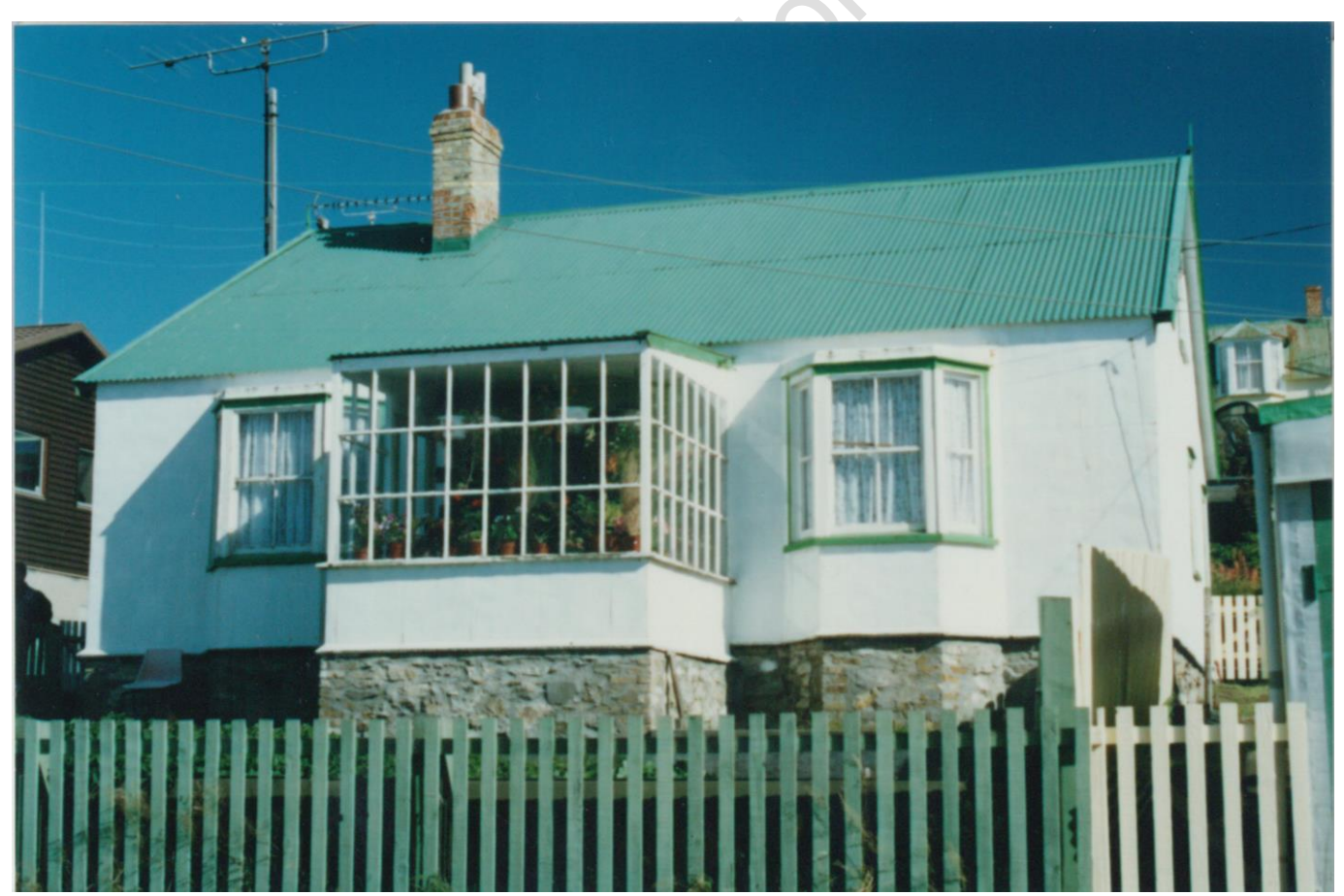
5 Philomel Street, 1994 - JCNA