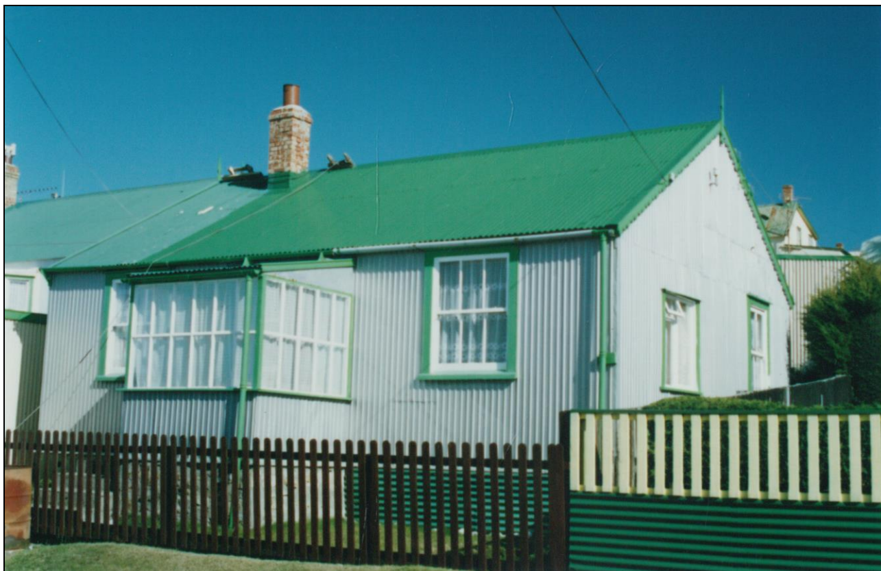
1994 - JCNA