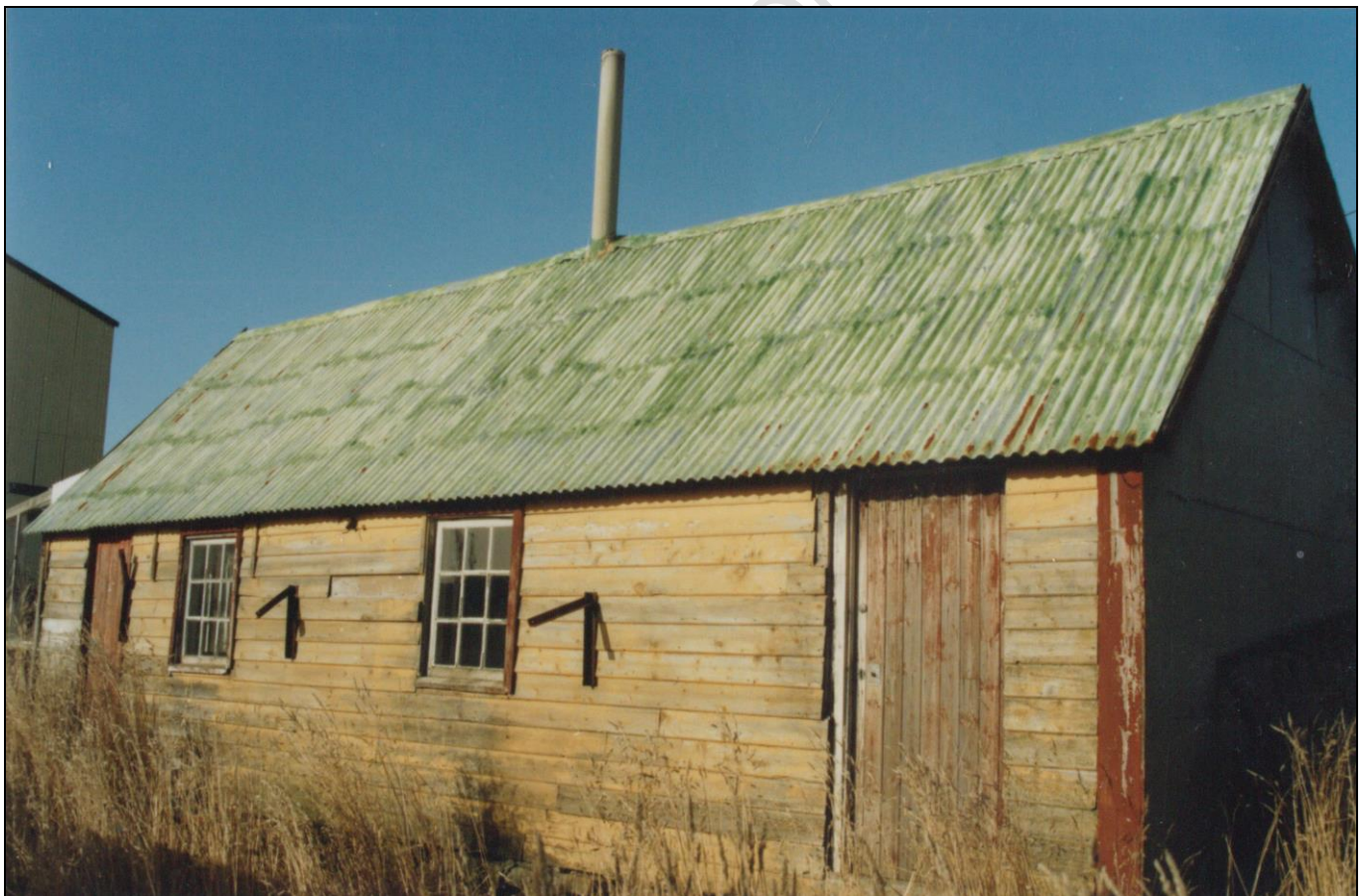
From the north west, 1990s - JCNA

Ellen "Nellie" "Granny McASKILL" , age 100, died 5 July 1969 in Stanley.