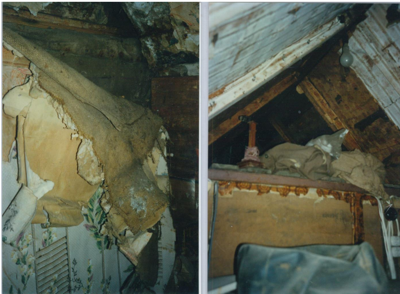
Inside, lining details and ceiling, 1990s - JCNA