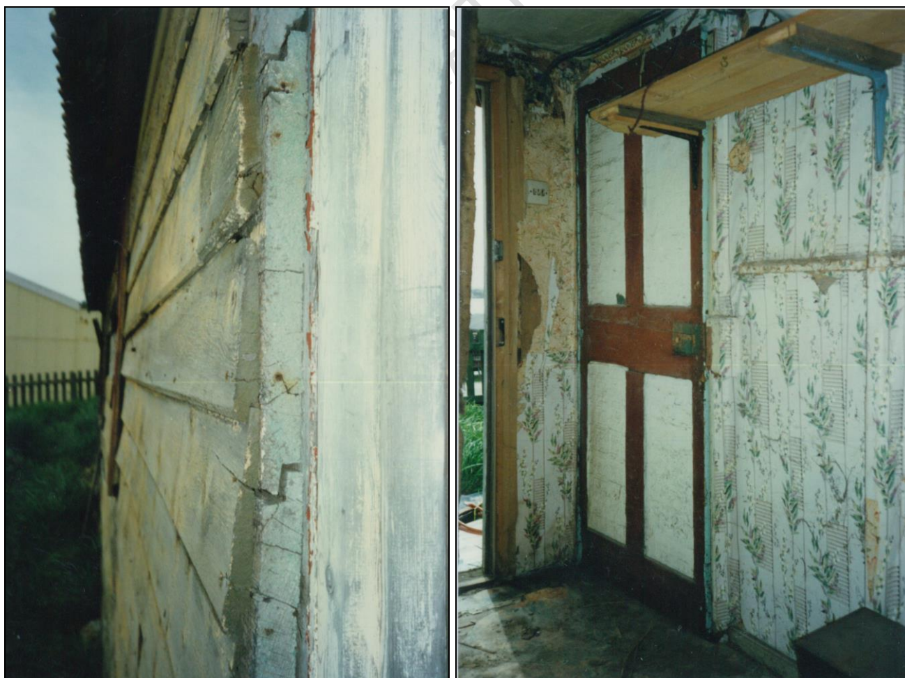
From the west, weatherboard details, and inside, 1990s - JCNA