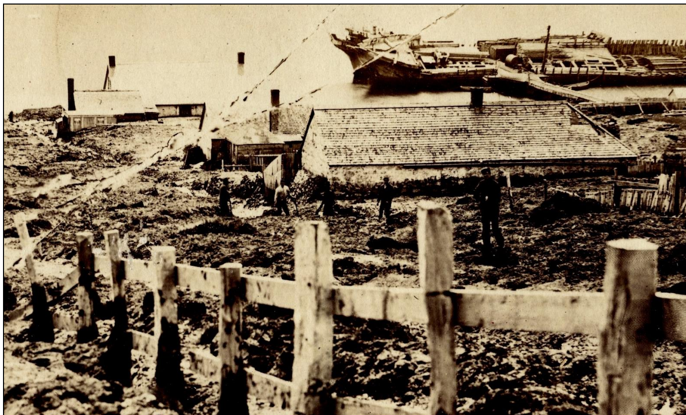
From the south west, centre building; after the peat slip of 29 November 1878