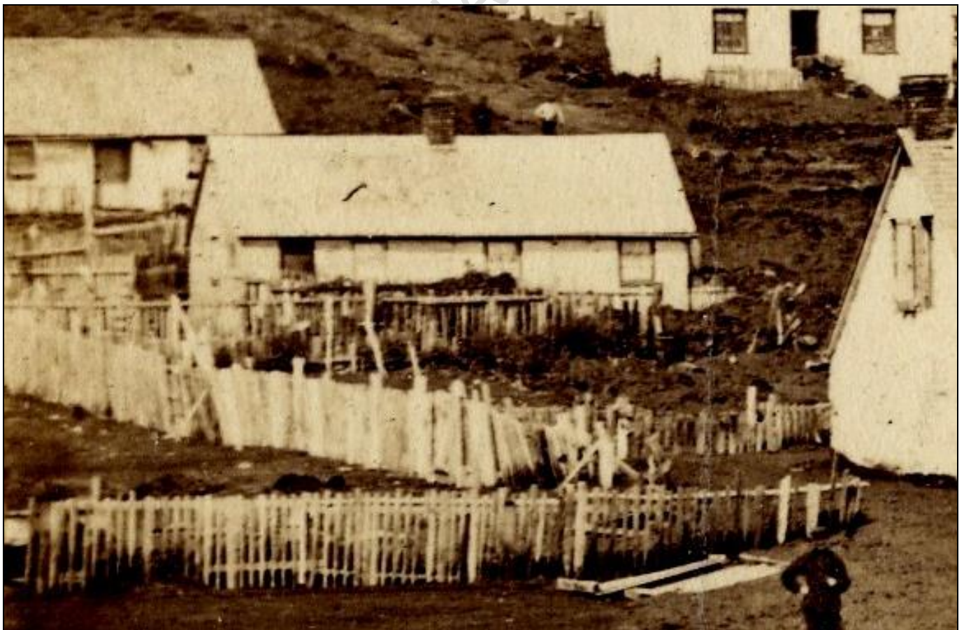
From the north east, centre building; after the peat slip of 29 November 1878

George Frederick KELWAY , age 48 years & 8 months and a carpenter, died in Stanley 6 October 1880 from consumption