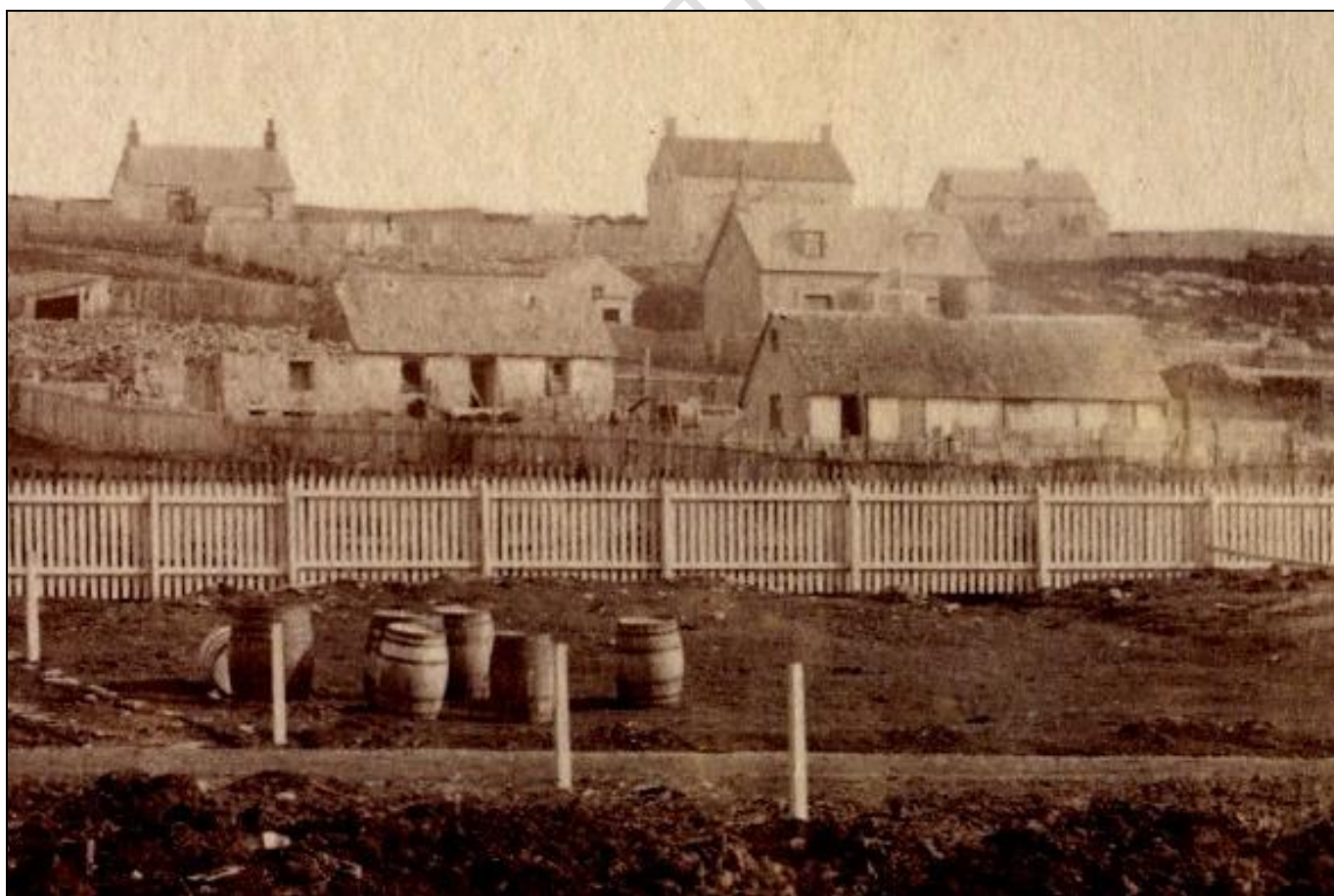
Front right