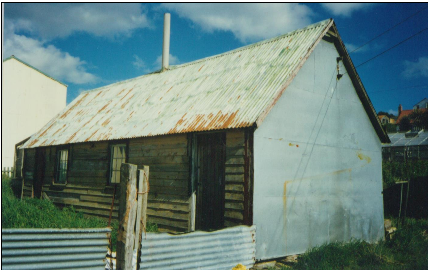
From the north west, 1990s - JCNA