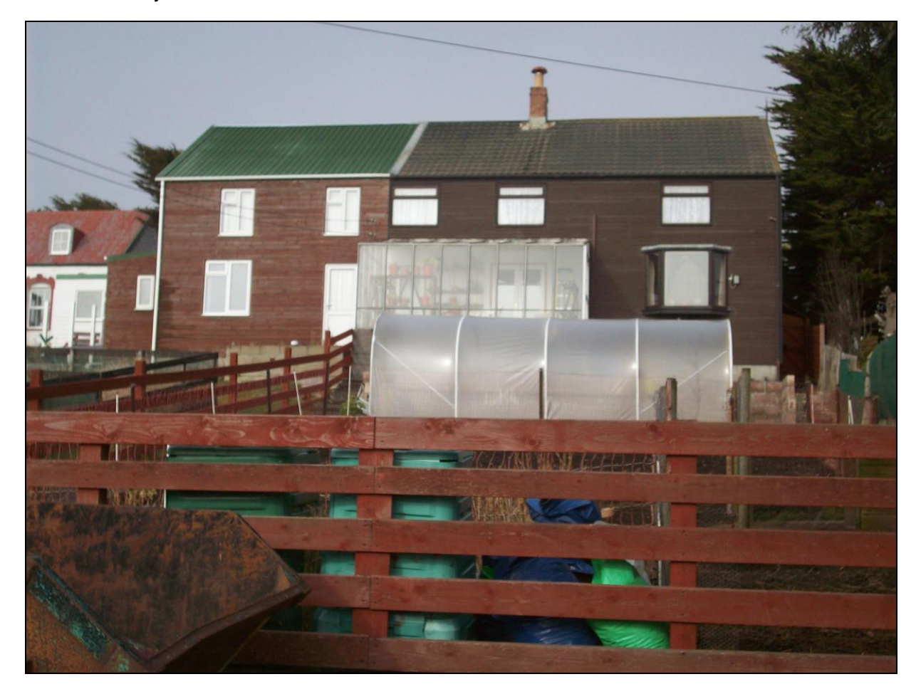
2 and 4 James Street 2019 - photographs JCNA