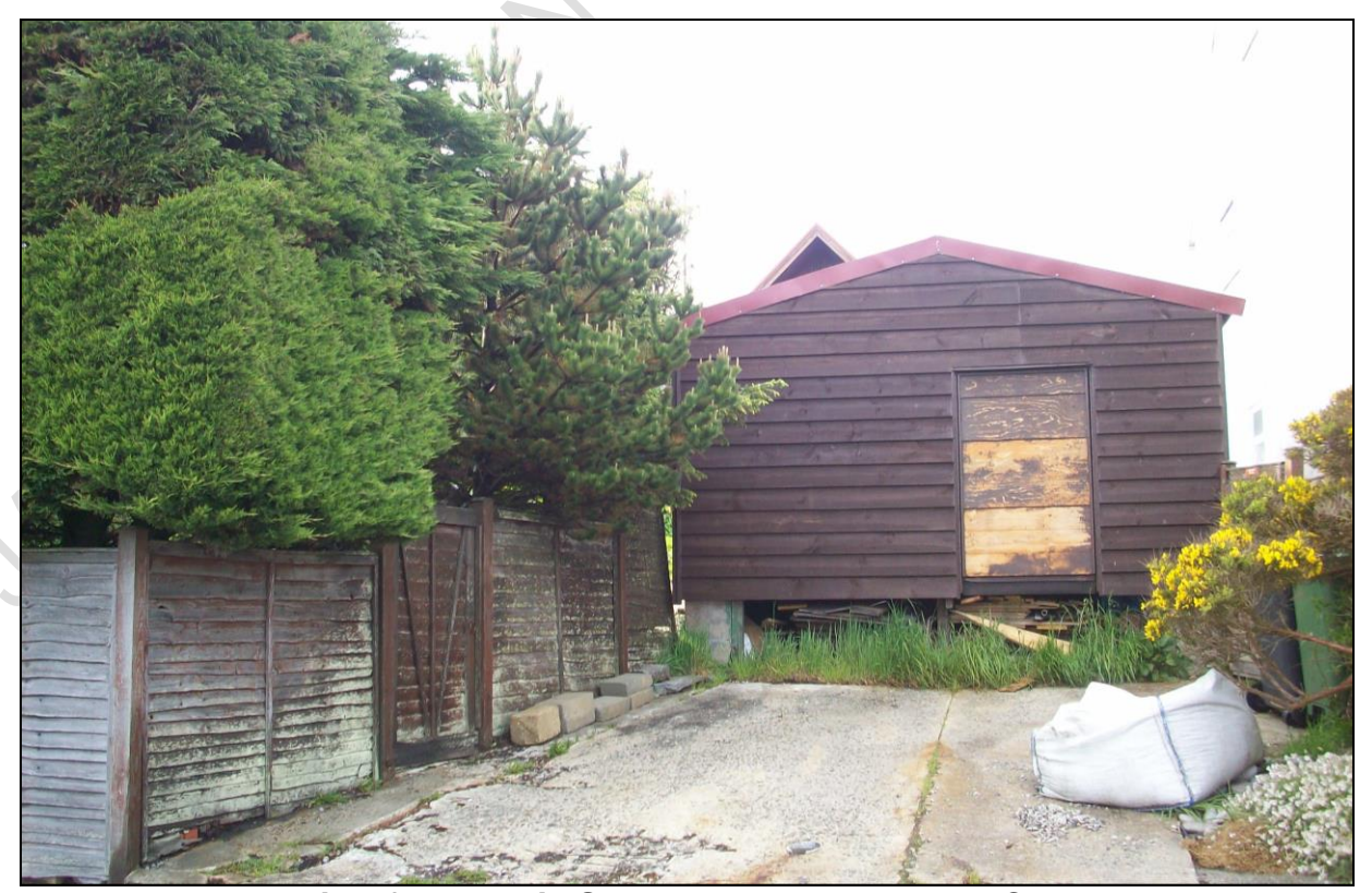
View from Davis Street December 2020

On 9 June 1990 an application by D B KING to build a two storey house on the plot was approved.