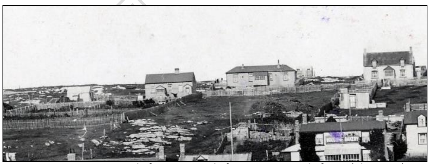
1927 - Back L-R: 37 Davis Street, 38 Davis Street and 36 Davis Street (Pill House)