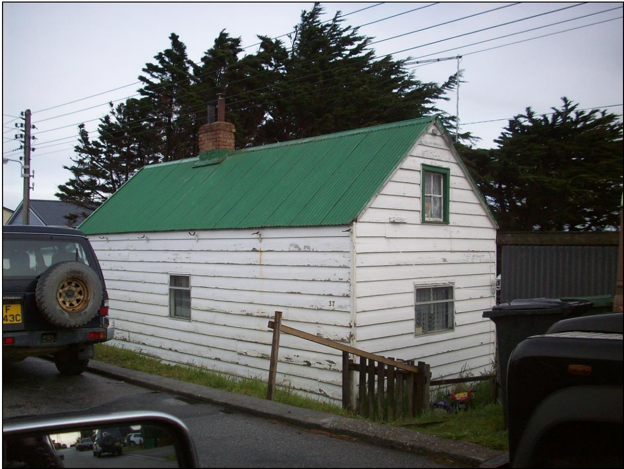
37 Davis Street from the south-east December 2020 - JCNA