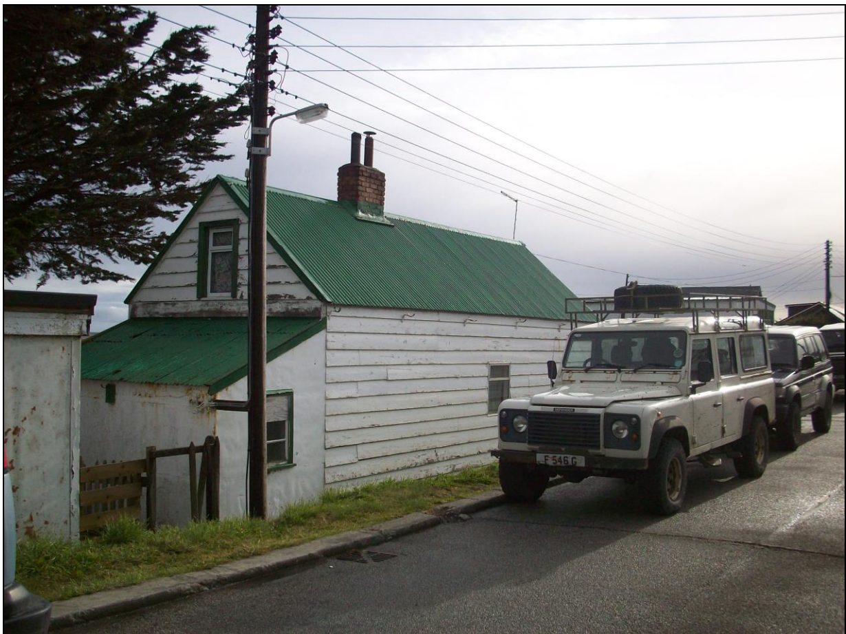
37 Davis Street from the south-west December 2020 - JCNA