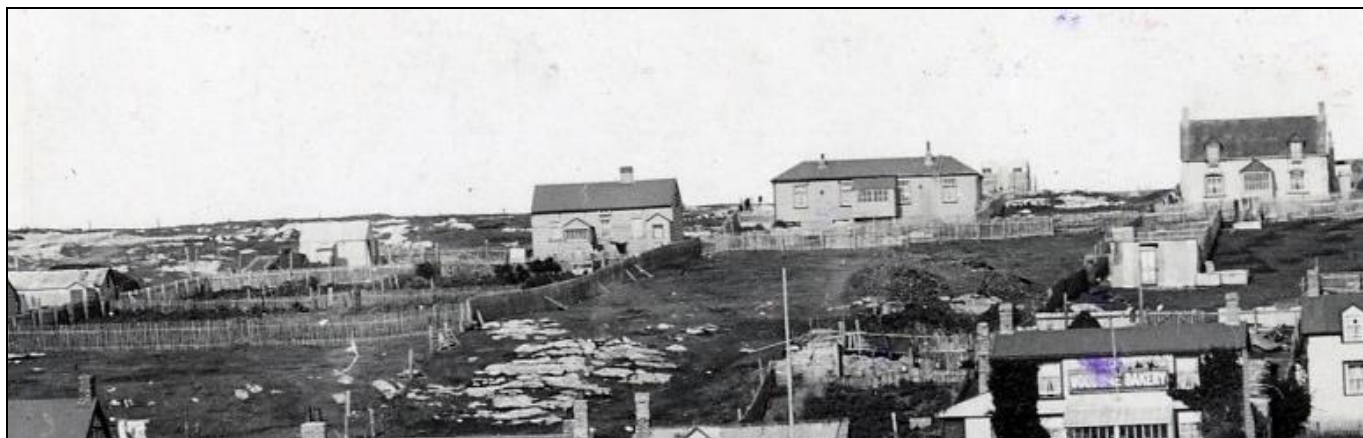
1927 - L-R: 37 Davis Street, 38 Davis Street and 36 Davis Street (Pill House)