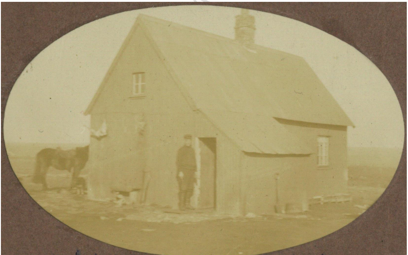
Old Elephant Beach House