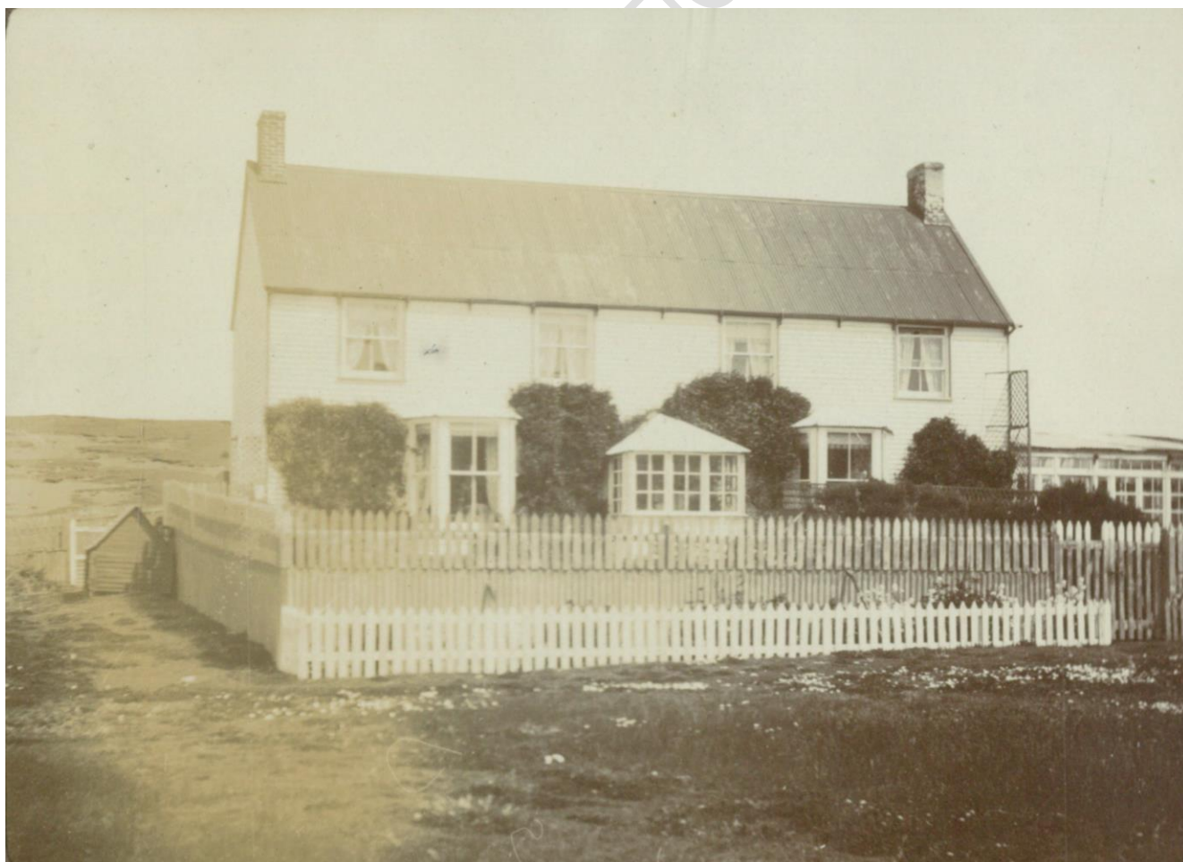
Manager's house San Carlos North circa 1900