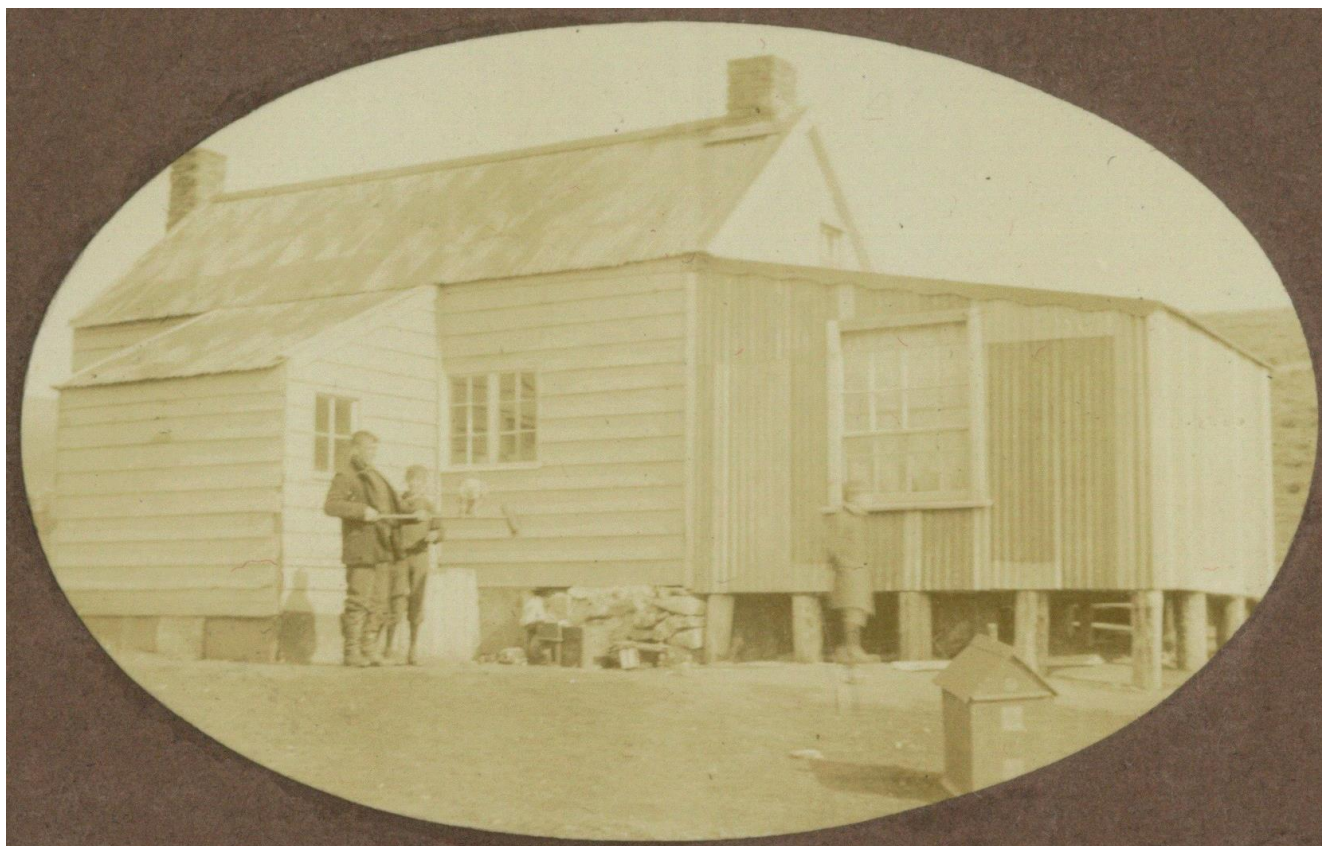
Old Moss Side House – Cameron album, JCNA