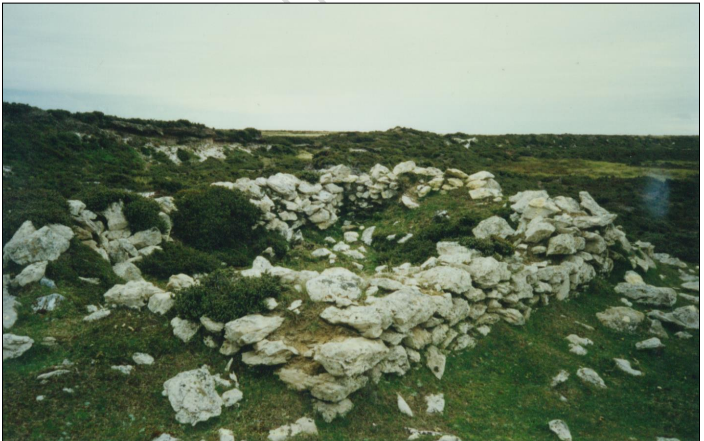
Remains of stone and clay hut on Long Island, 1996

In the 1830s a turf wall was built across Point William. “Corral and hut on Point William commonly known as the “Mangara”. This corral contains about 300 acres principally tussac and is formed by a sod wall and ditch constructed across a narrow neck of land between Kidney Cove and Point William, - on the spot marked I on the Chart of the Falkland Islands. It was original built by the Naval officers in charge of the Islands before it was made a Colony but was thoroughly repaired in 1846 at a cost of 60£ to the Colonial Government. A turf hut very small was at the same time constructed outside the gate for the use of the Guacho in charge of the Government cattle. The Government cattle and horses were kept there for a year after it was repaired. 16 September 1848.” [E1; pg 157]