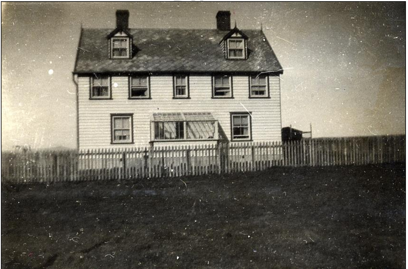
Front view of the manager's house at Anson

The five roomed farm hand's cottage at Anson, approximate size 32' x 24' x 14' to eaves, was built by Messrs GRIERSON and DETTLEFF and completed in 1926 at a cost of £1,110. [AGR/ANS/2#2]