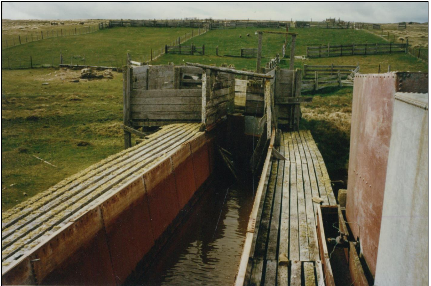
The Green Patch Dip, 1996

Mount Kent.. On the South by a range of mountains of which Mount Kent forms one and by the River Murrell till it meets the suburban boundary of the SW corner of Section 57.” [BUG-REG-9; pg 43]