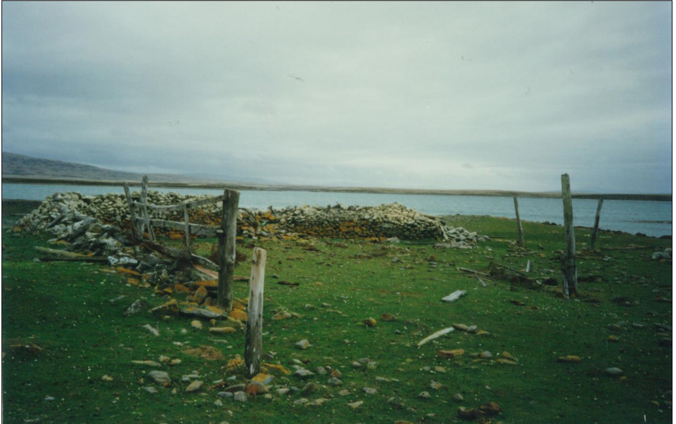
Remains of drystone corral on Long Island, 1996

In March 1843 a hut was built at Long Island. “This hut is situated on the shore of the mainland facing the ford leading to Long Island. It is built of stone and clay with a good roof, door and fireplace. It has not been inspected on the part of Government since October 1845. It was then in good repair. It was built in March 1843. The site of the hut is marked G in the chart of the Falkland Islands. The corral is a small one built of dry stones not very well. The walls are thin and low, it was in good repair in October 1845. It is situated on a point covered with shingle on the west end of Long Island marked H on the Chart. 28 September 1848.” [E1; pg 161]