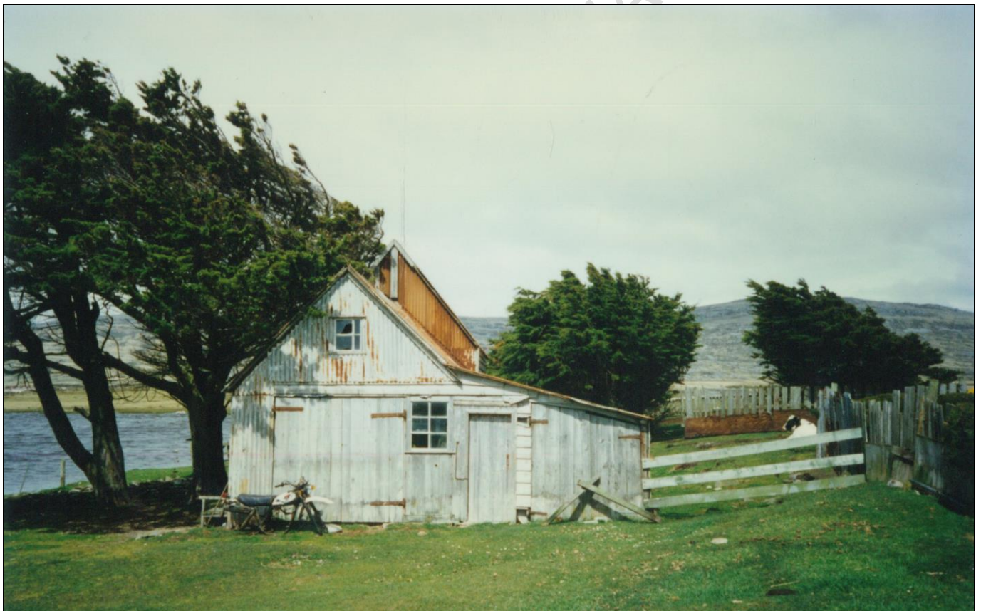
The old house at Long Island thought to be built during the 1870s. Before being extended the house originally consisted of two rooms downstairs and one upstairs