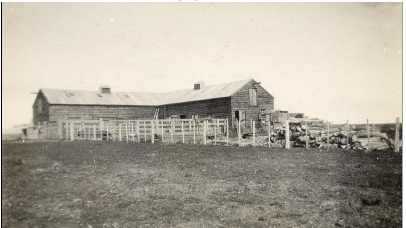
Anson stables – photo FIC Collection, JCNA

Foundations for the eight-roomed manager's house were started in March 1926. The approximate size of the house was 40' x 30' x 16' to eaves and back view. Built at a cost of £2,904. [AGR/ANS/2#2]