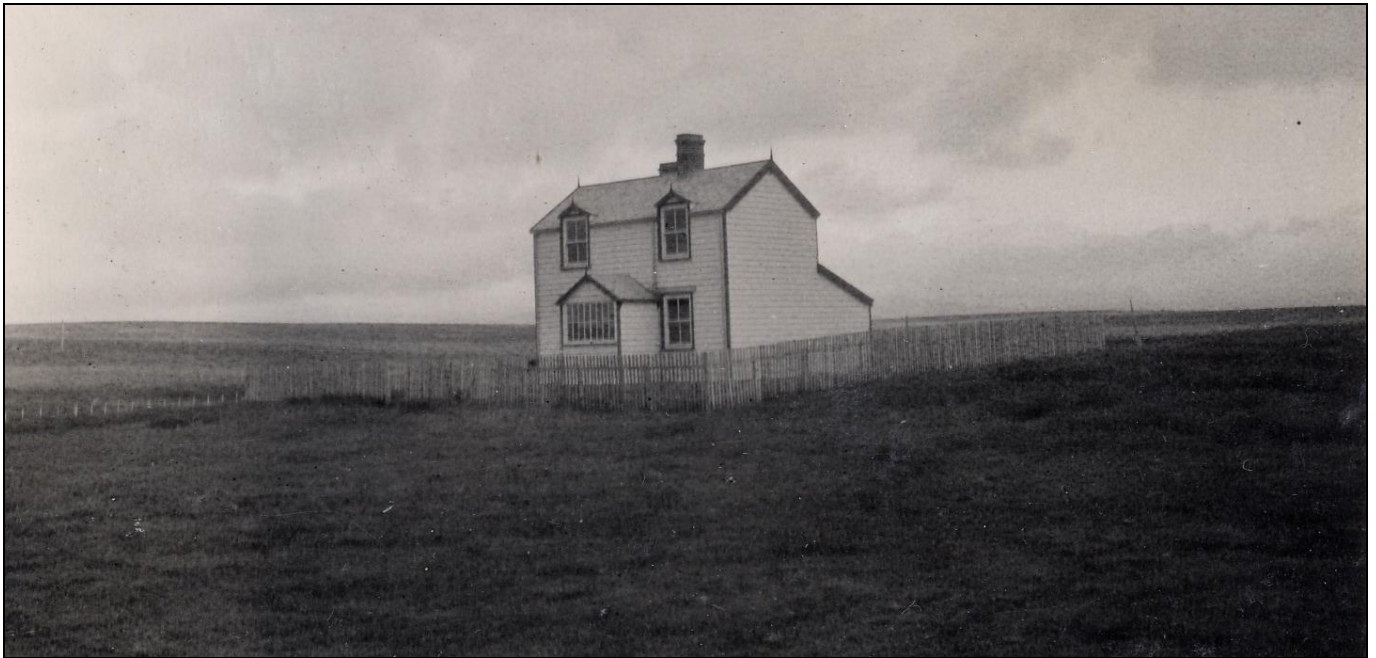
Farm hand's cottage at Anson

with a total acreage of 5,224 for Block 5. During 1925 £2,499 was disbursed from the Land Sales Fund to meet the initial establishment costs. £7,630 was disbursed from the Land Sales Fund during 1926 on the establishment and on stock investigation and research, £8,802 during 1927 and £1,361 in 1928. [R/AGR/SHE/1#2: Col Ann Reports; 1924-1928]