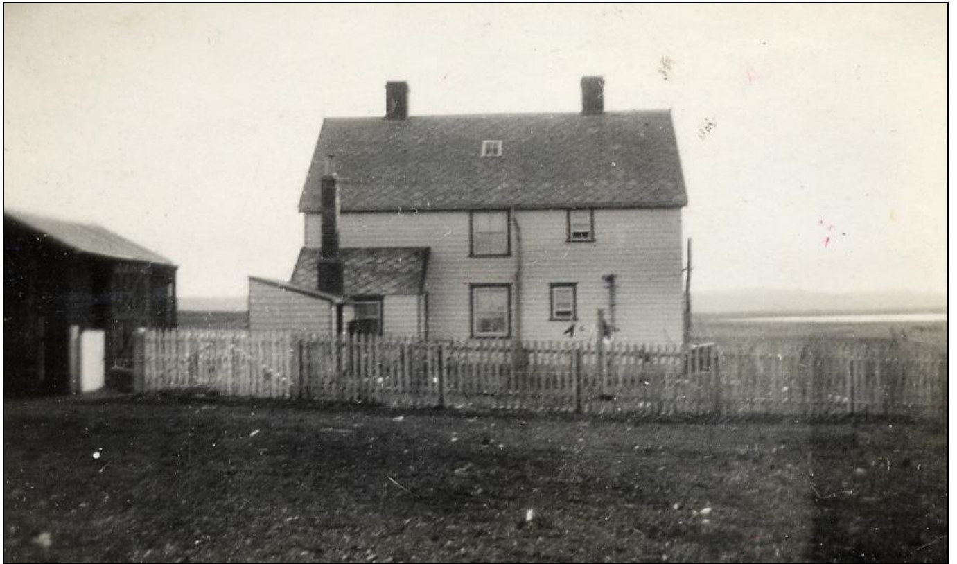
Back view of the manager's house at Anson

Foundations for the eight-roomed manager's house were started in March 1926. The approximate size of the house was 40' x 30' x 16' to eaves and back view. Built at a cost of £2,904. [AGR/ANS/2#2]