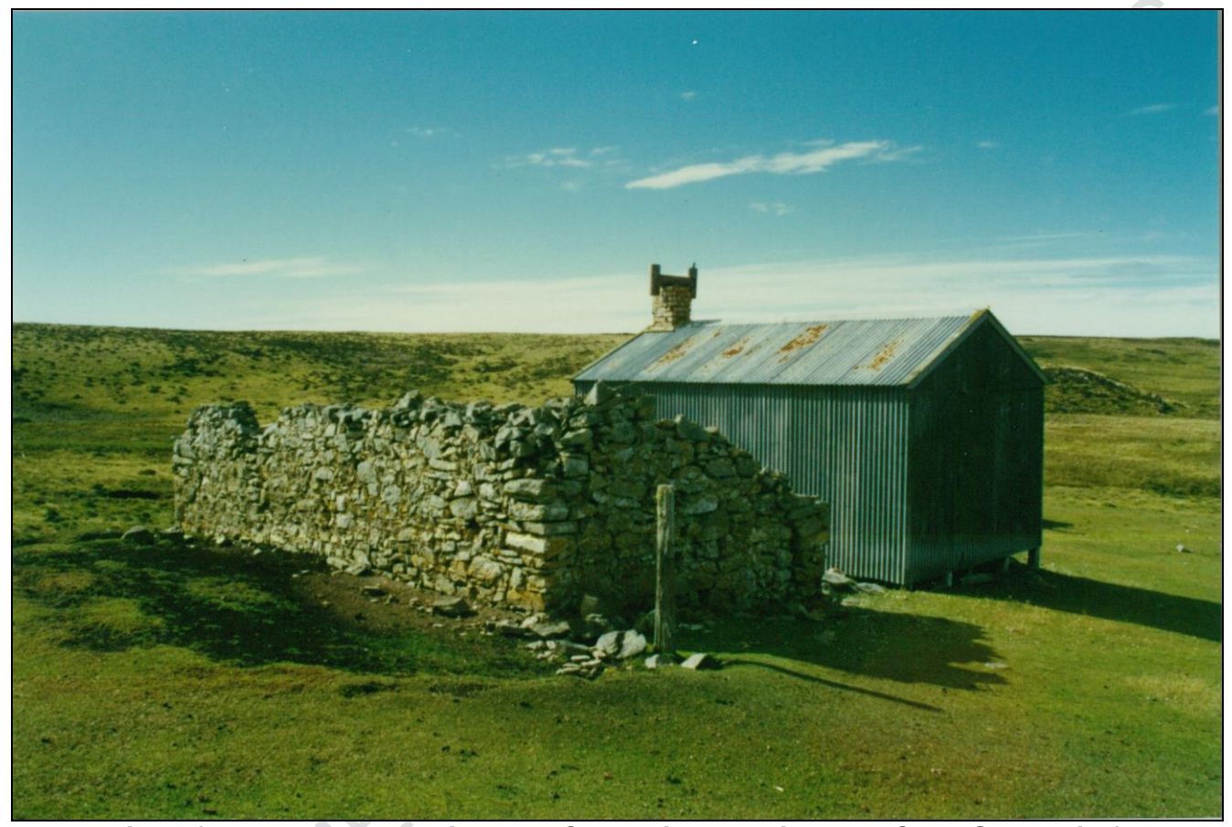
Remains of stone house at Diamond Cove with the Diamond Cove Shanty in front, 1997

On 26 February 1870 Andrez PETALUGA was granted a licence for £5 to occupy a station at MacBrides Head bounded "On the East by the West boundary of Station No 43 running 3 miles South from the sea and MacBrides Head. On the South East by a line drawn 4 miles South West by West. On the West by a line drawn 3 miles North to the sea, and thence on the North by the sea to the starting point at the North West angle of Station No 43, as aforesaid." [BUG-REG-2; pg 240]