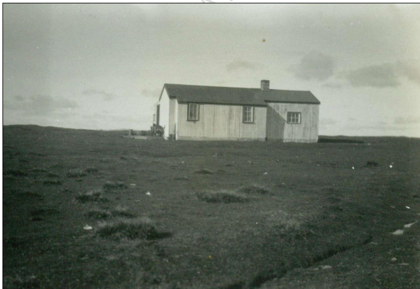
Docherty's Shanty, Douglas Station